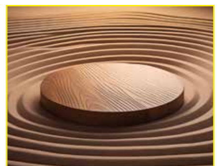
Transformer mechanisms, furniture wheels, swivel platforms, rollers