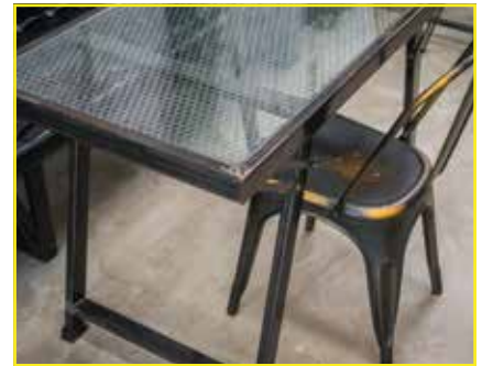
Aluminum pipes for (chairs, tables)