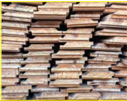
Plywood/MDF/HDF/OSB (wood boards)

With over 3,500 furniture manufacturers in attendance, Woodex 2025 is the perfect platform to showcase your latest fittings and components.