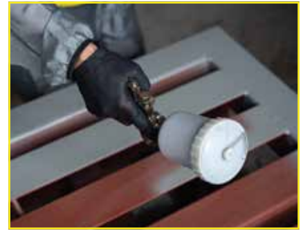
Varnish/Paint/ Glue polishing