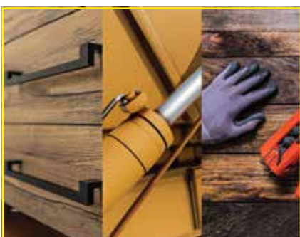
Handles, gas lifts, protective devices, extension systems