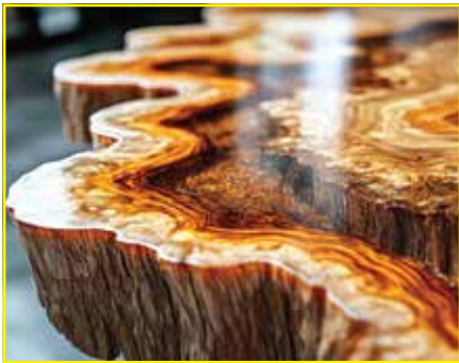
Resins for plywood production