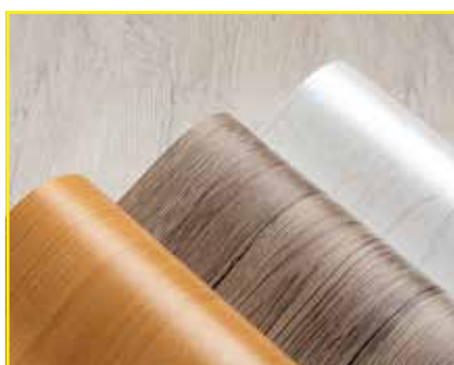
Veneer, edge, PVC film for tabletops and other surfaces + cabinet furniture