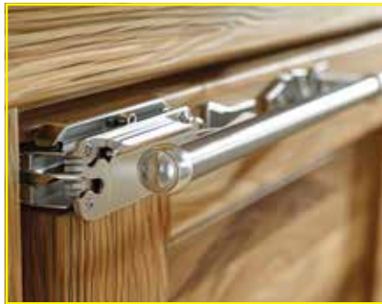
Hinges, fasteners, guides