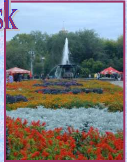
The Central Square named after S.M.Kirov