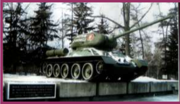
The Tank “Irkutsk Komsomolets”