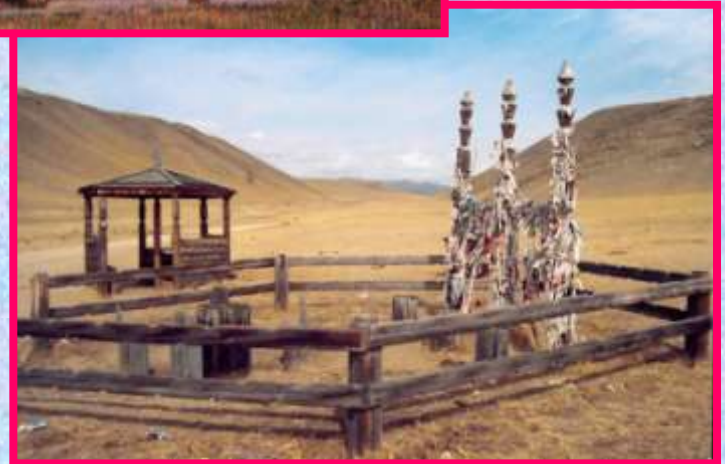
One of the Places of Traditional Rituals of Buryats