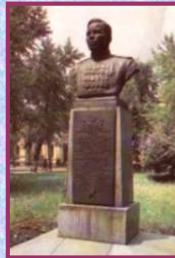
A Monument to A.P.Beloborodov (Twice Hero of the Soviet Union)