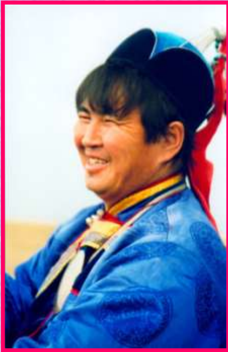
The Buryats National Instrument 'Knur'