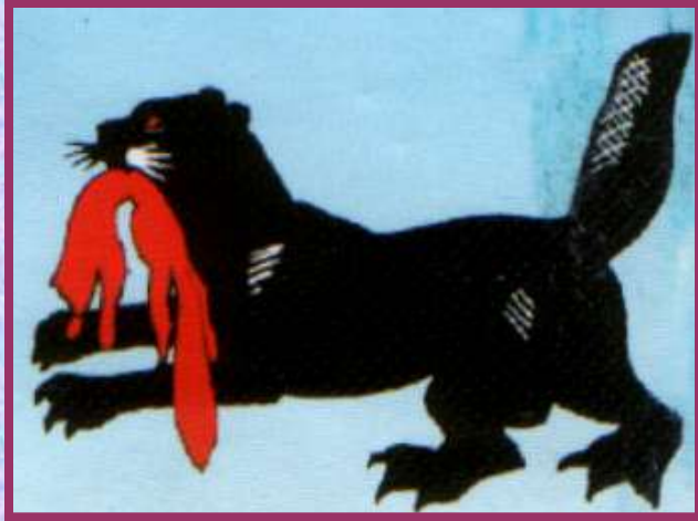
The coat of arms of Irkutsk

The ostrog of Irkutsk was founded in 1661 on the 6 th of July by Yakov Pokhabov