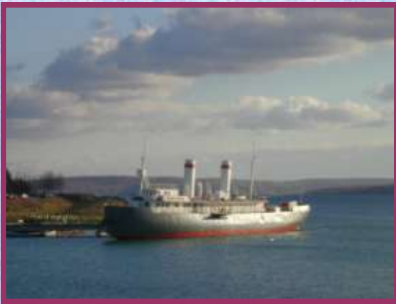
Ledokol “Angara” (a museum)