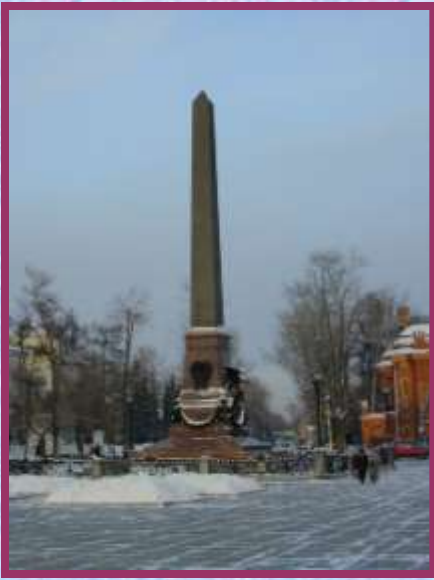
The Obelisk to the First Explores of Siberia