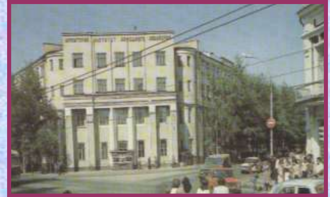
The University of Economy