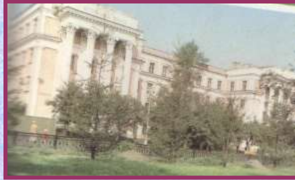
The Linguistic University