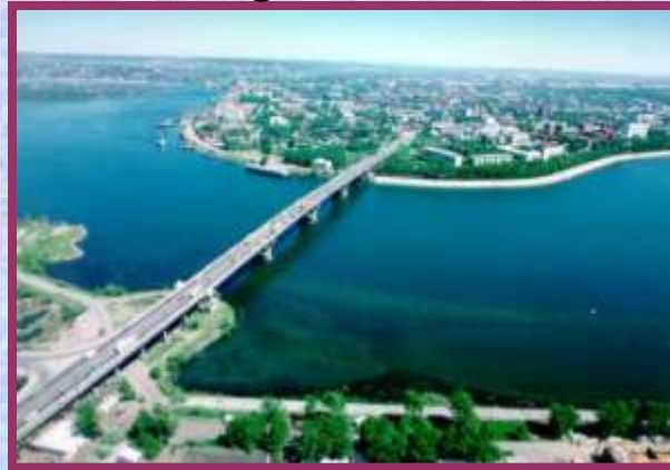
The New Bridge Over the Angara River