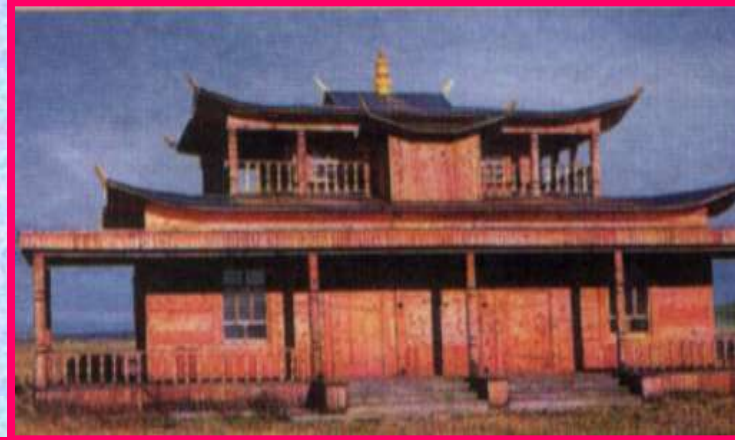
Datsan – Buryats Cult Religious Building