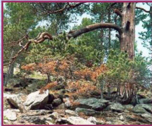
500 years old trees