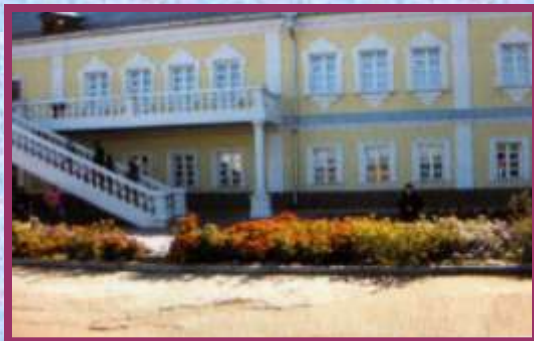
Teacher`s Training University