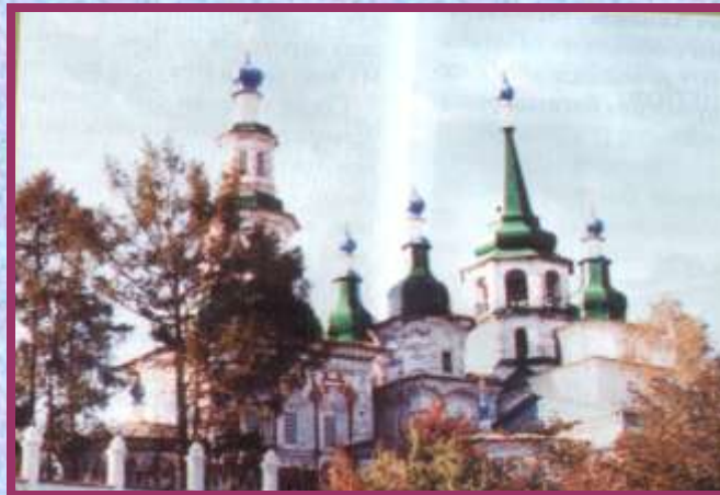
The Cathedral of Znameny