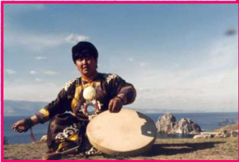
The Buryats Shaman