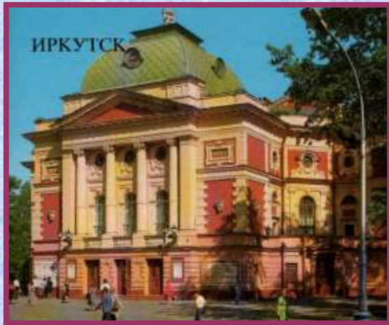
The Drama Theatre named after N.P.Okhlopkov