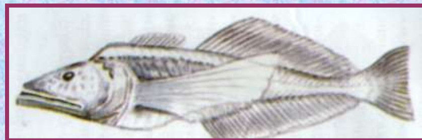
golomyanka – the only viviparous freshwater fish