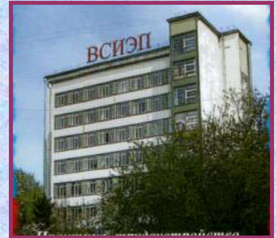
East Siberian Institute of Economy and Right