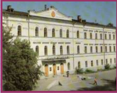
Classical State University