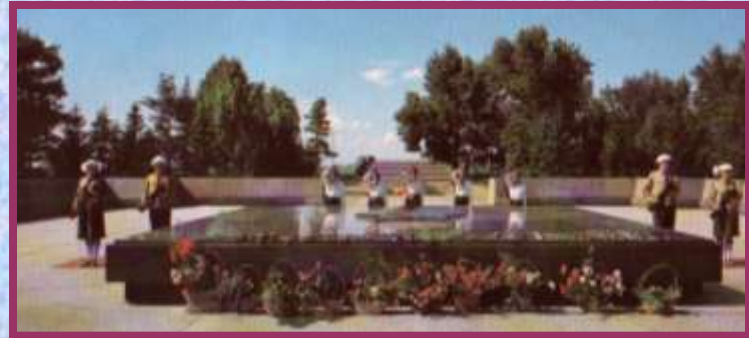
War Memorial “Irkutsk Citizens in the Great Patriotic War of 1941 – 1945”(opened in 1975)