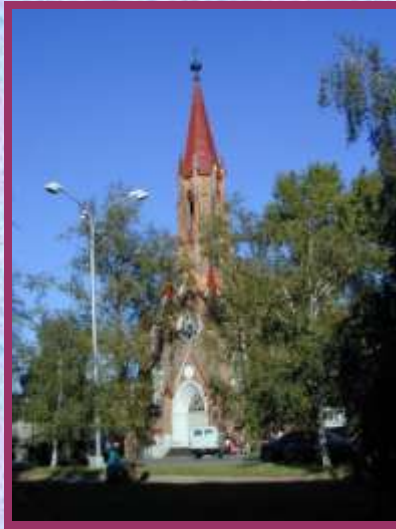
A Polish Cathedral (1884) (An Organ Concert Hall)

The 18 th century's church of the Savior (1706-1710)