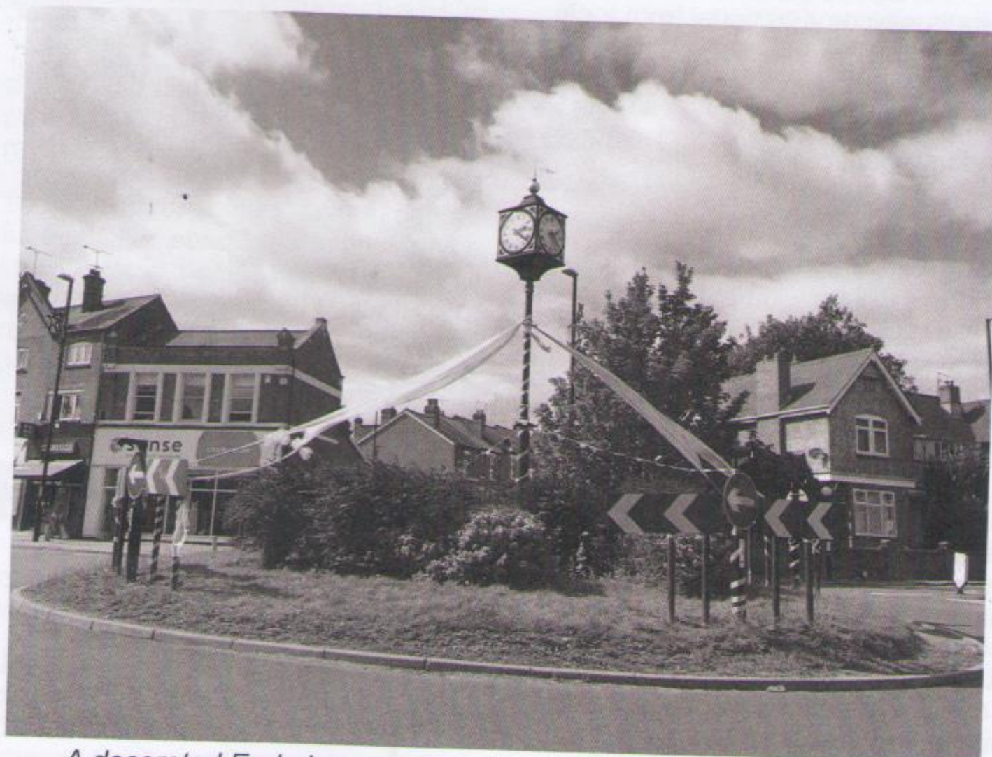
A decorated Earlsdon roundabout