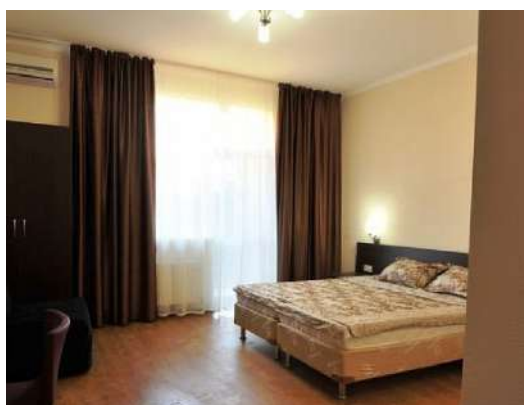
TWO-ROOM FAMILY ROOM 2-ROOM SUITE FOR 2-4 PEOPLE