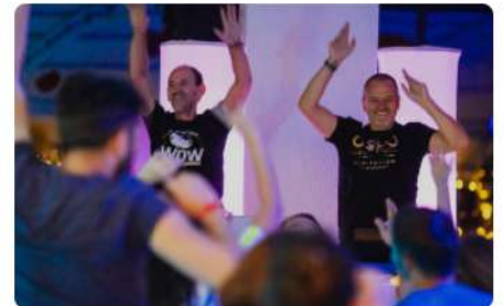
EVENING EVENTS CONCERTS, PARTIES, CREATIVE NIGHT, SHOW PROGRAMS, LIVE MUSIC