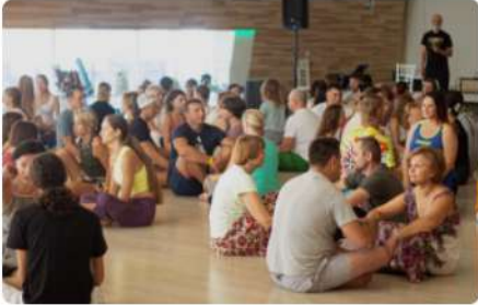
SEMINARS AND MASTER CLASSES FROM THE BEST WORLD LEADERS IN A VARIETY OF AREAS