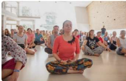
MEDITATIONS FROM THE "BOOK OF SECRETS"