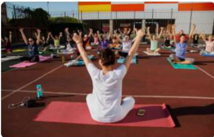
MORNING CLASSES YOGA, GURDJIEFF MOVEMENTS, SUFII WHIRLINGS, ETC.