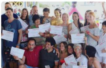
TRAININGS PROFILE PROGRAMS FOR THOSE WHO ARE READY TO MOVE DEEPER

ADDITIONAL EVENTS ARE NOT INCLUDED IN THE TICKET OF THE PARTICIPANT OF THE FESTIVAL AND, IF YOU WISH TO PARTICIPATE, ARE PAID SEPARATELY