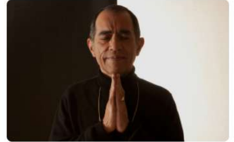
VEERESH MEDITATIONS AUM, SAMASATI, OUR SACRED EARTH, ETC.