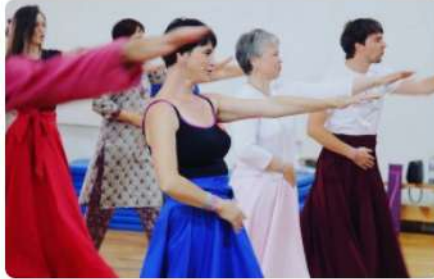
OSHO MEDITATIONS DAILY: 7 - 8 DIFFERENT OSHO ACTIVE MEDITATIONS