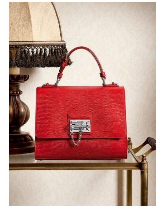
No. Staged photo