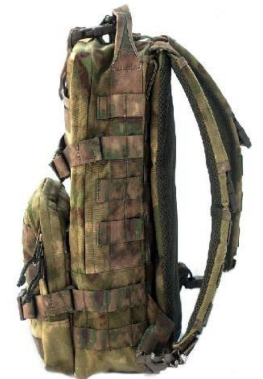
No. \frac{1}{2} angle is not suitable for the catalogue