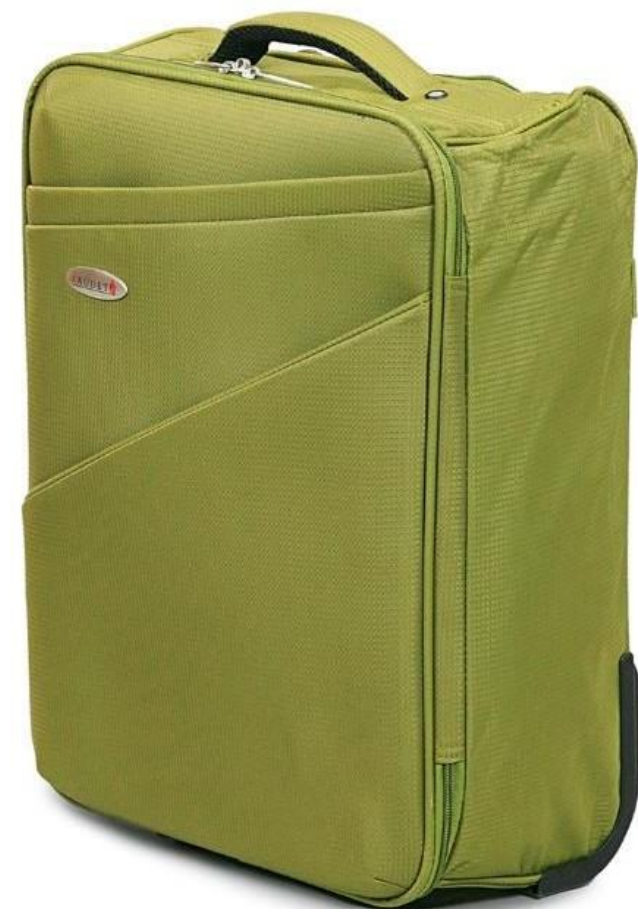
Yes. Acceptable angle