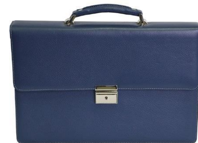
No. No shooting from top downward