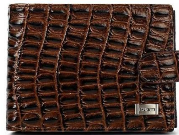
Yes. Acceptable angle