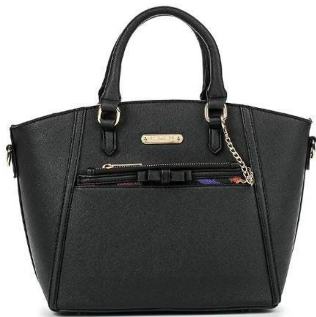
Yes. Acceptable angle

Bags, backpacks, luggage bags and wallets may be shown from the front or at a \frac{3}{4} angle.