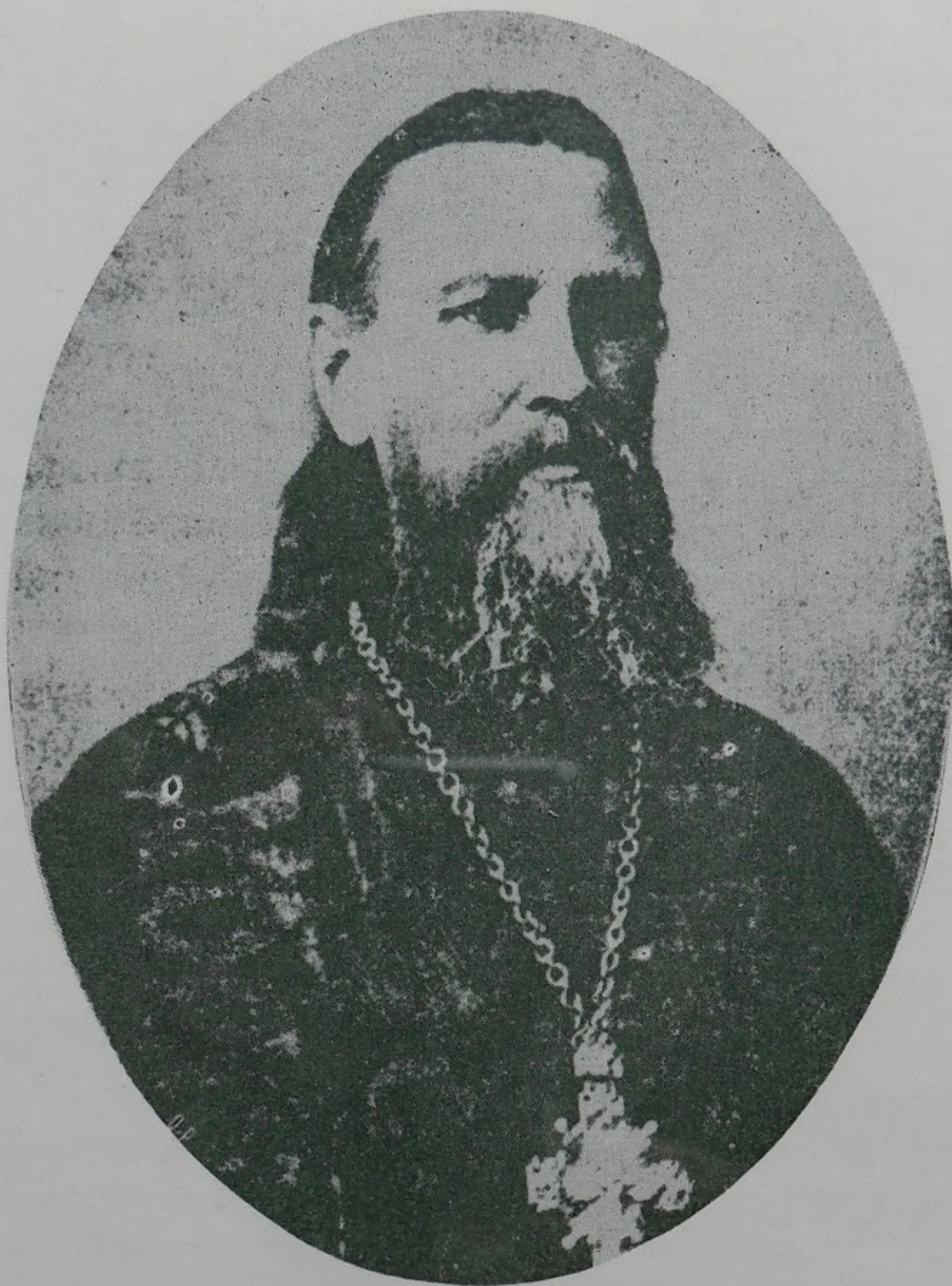
ST. JOHN (SERGIEFF) OF KRONSTADT 1829 - 1908

More perhaps than any other Russian Saint, St. John embodies the joyful radiance of the Easter Feast, so much so that he was called by the Russian people the Paskhalny Batiushka, which might be translated "the priest of the paschal joy". The Church celebrates his memory twice a year, on Oct. 19 and Dec. 20.