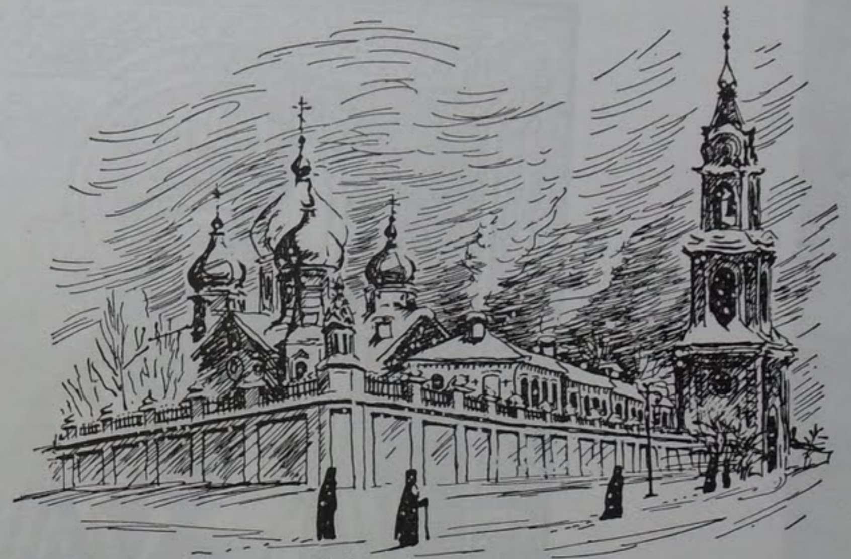
The Ascension Monastery in Irkutsk

His constant labors, the severe Siberian climate, his long journeys, and sorrow and affliction broke down the already frail health of St. Innocent. He fell ill and in the autumn of 1731 lay in bed, unable to celebrate the services. In the morning of November 27, 1731, he peacefully departed to the Lord, being about fifty years of age. Amid the weeping of his flock, the body of the Saint was buried in the church of the Tichvin Icon of the Mother of God in the Ascension Monastery.