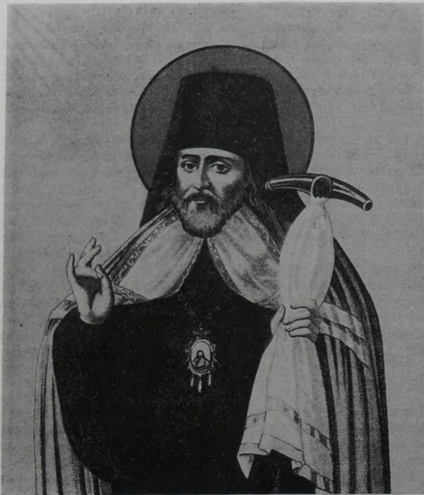
ST. INNOCENT OF IRKUTSK