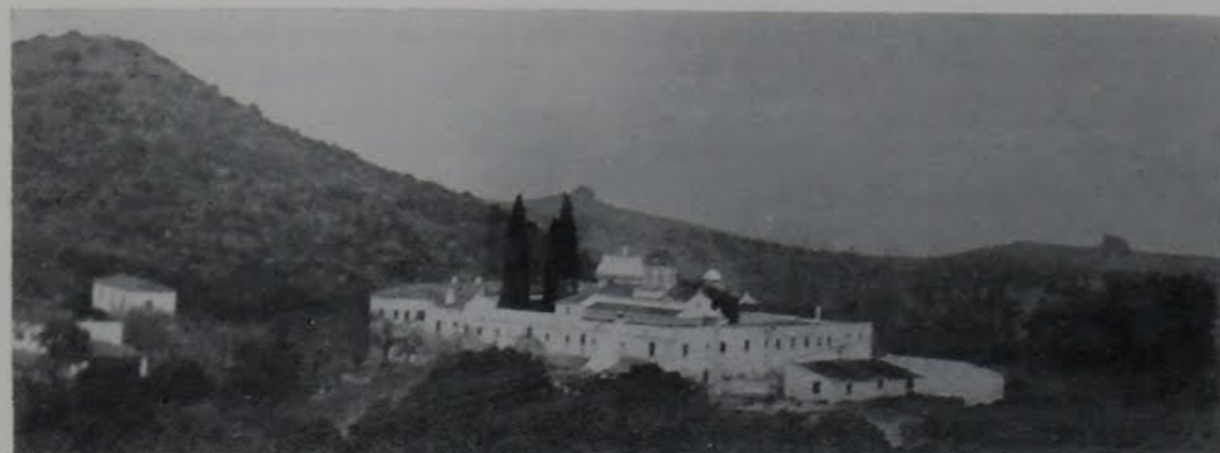
Aegina: The Convent of the Holy Trinity, established by St. Nectarios, as it appears today