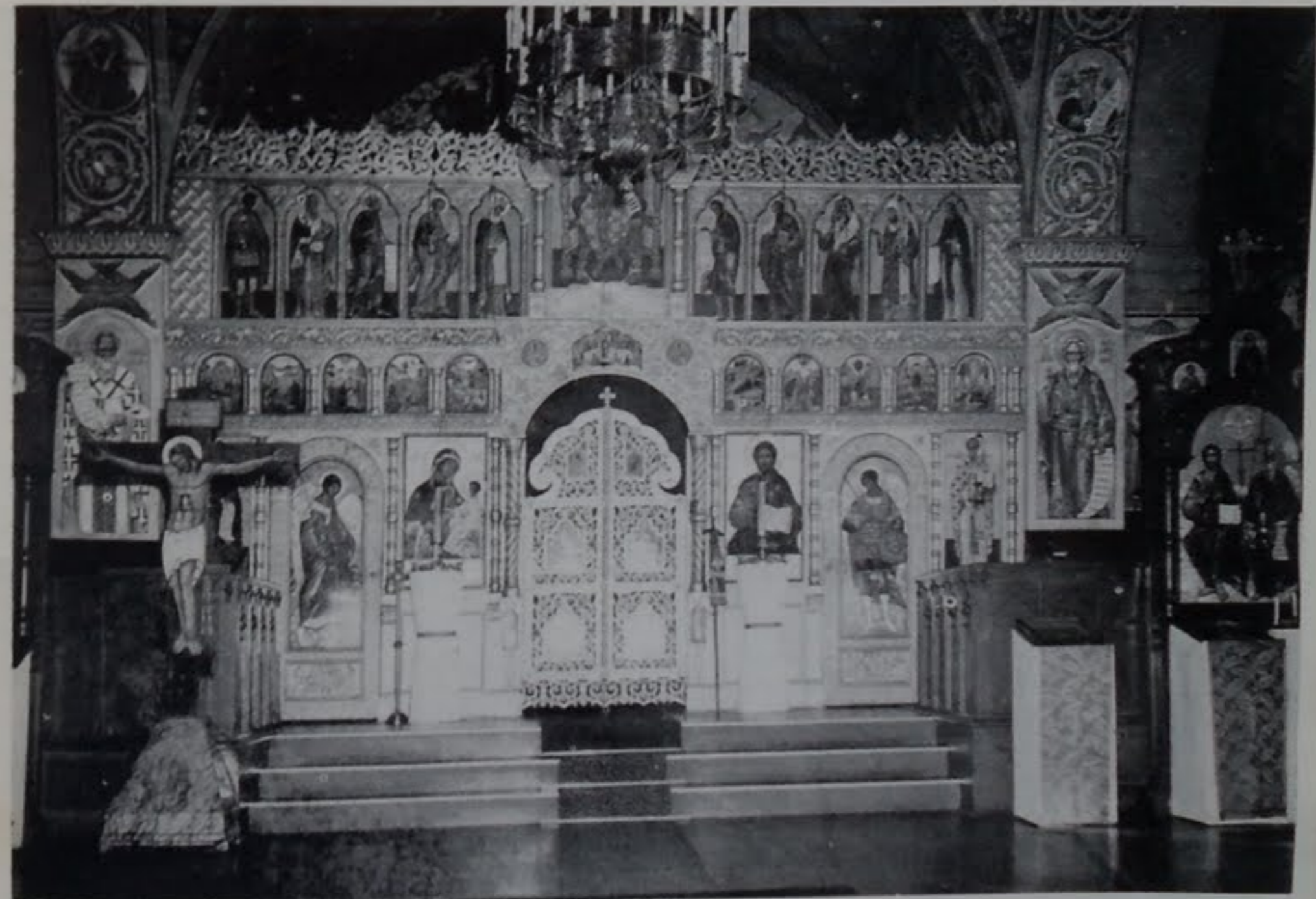
Icon-screen of the main church, hand-carved by the monks.

writer. A "reading on the Sublime" only extant.