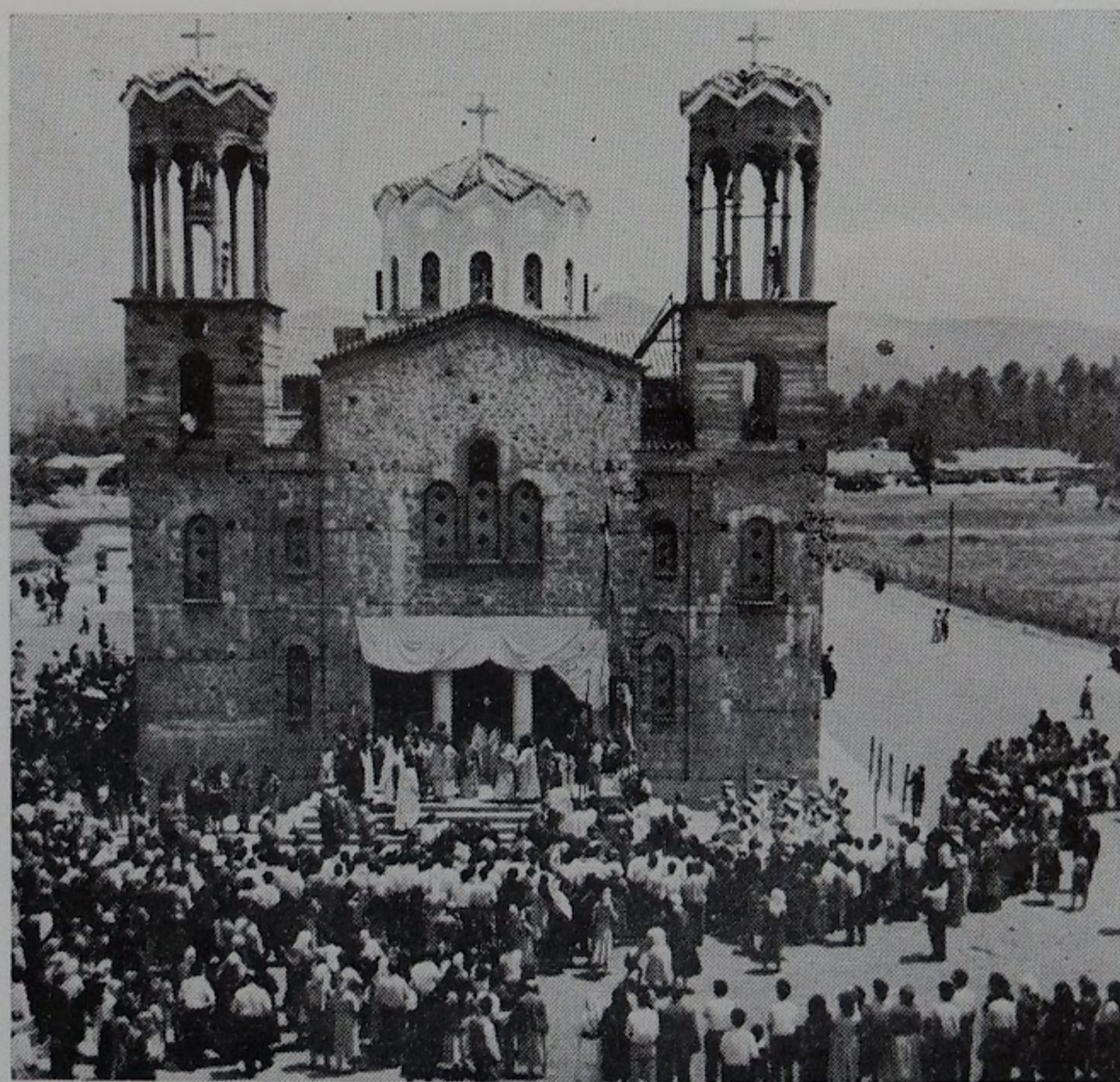
The church of St. John in New Procopion, on the feast day of the Saint.