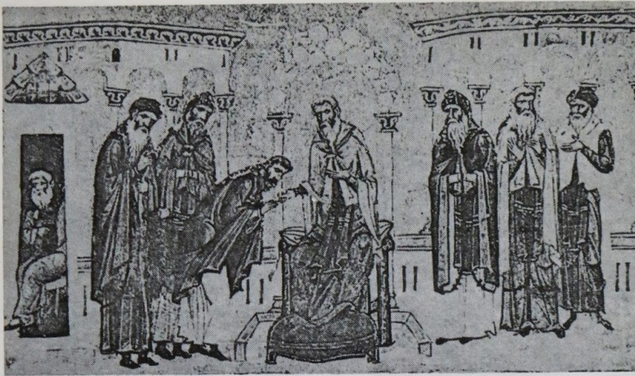
St. John presents the Ladder to the monks of Raithu -- illustration from an ancient manuscript of the Ladder