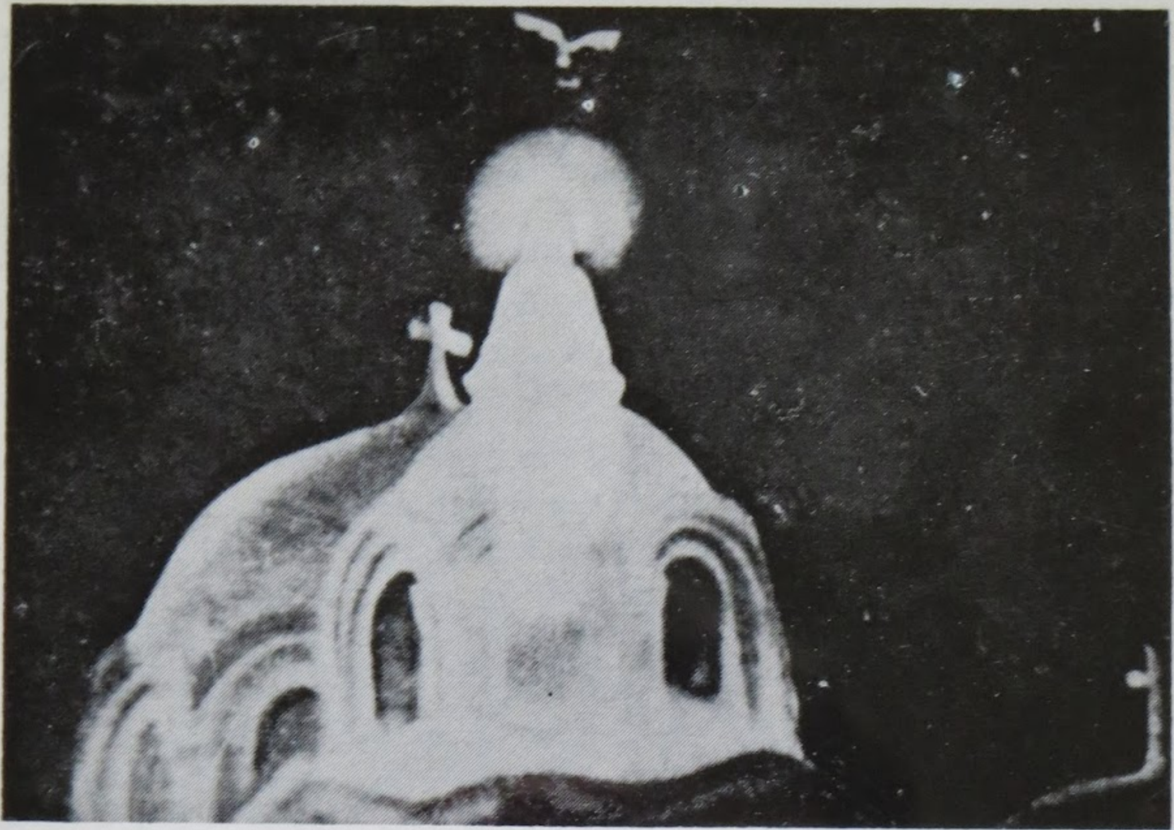
The Apparition of the Most Holy Mother of God at Zeytoon -- as photographed during one of its actual occurrences in 1968

“Her appearance has occurred at night on various occasions and in different forms. Sometimes She has appeared in full stature, at others only in half stature. She has always been bathed in a luminous halo of dazzling brightness. In some cases She has come through the openings of the domes of the church, but mostly She has moved above them, bending Her head and blessing the vast multitudes by raising both hands. She would bow in front of the higher cross that was then radiating with very bright light. At other times She has appeared in the form of lights or whitish clouds preceded by the bursting forth of spiritual beings like divine doves that flew at high speed. In duration the holy appearance has lasted for long periods that were occasionally extended to two hours and a quarter, as on that night [April 30, 1968] during which She appeared fully in unfailing lustre between 2:45 and 5:00 a.m.