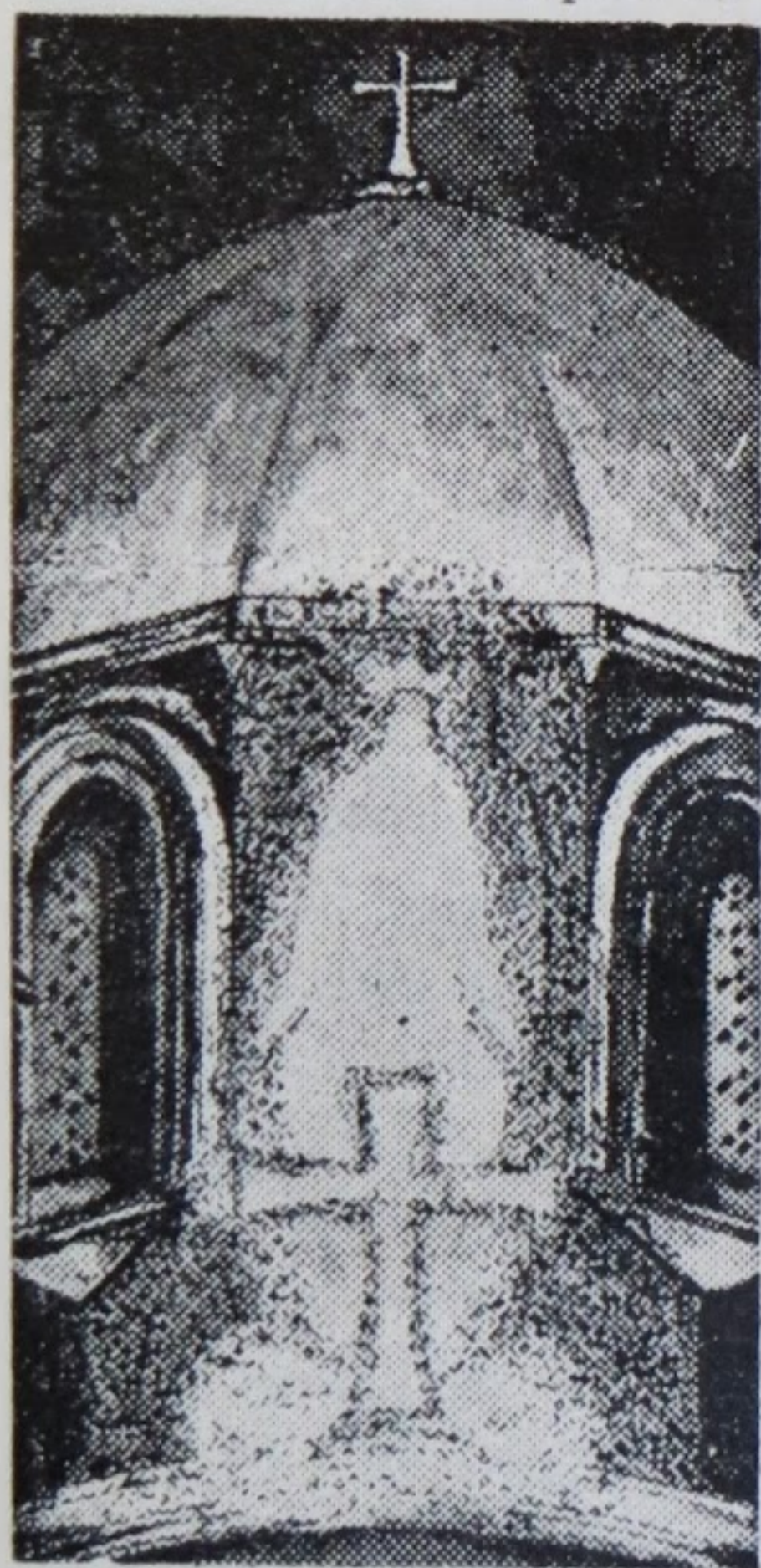
A view of one apparition, reproduced exactly from the Cairo newspaper Watani

The first apparition of the Virgin Mary occurred above the domes of the church on April 2, 1968, at 8:30 p.m., and it was witnessed by a