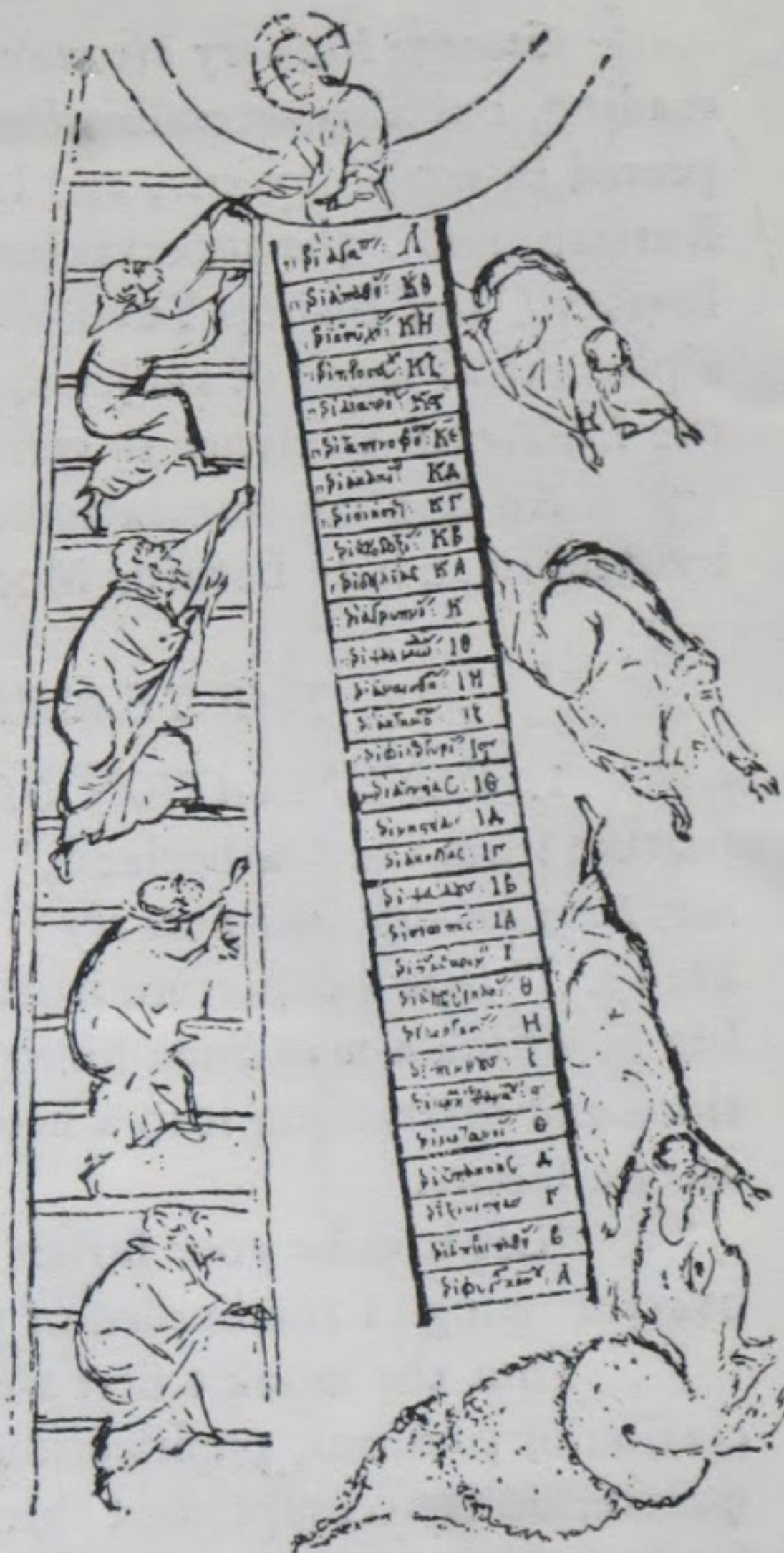
The Ladder of ascent to heaven -- from an ancient manuscript