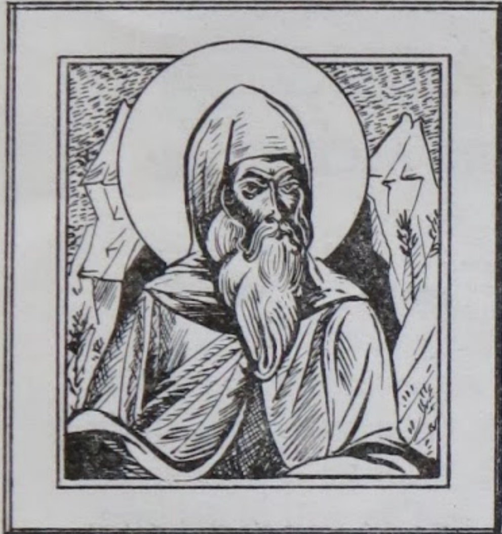
St. Anastasius of Sinai

A monk of Sinai relates: "Once Abba Martyrius came with Abba John [Climacus] to Anastasius the Great; and the latter looked at them and said to Abba Martyrius: 'Tell me, Abba Martyrius, where is this youth from, and who tonsured him?' He replied: 'He is your slave, Father, and I tonsured him.' Anastasius said to him: 'O, Abba Martyrius, who would have thought that you would tonsure the abbot of Sinai?' And the holy man was not mistaken."