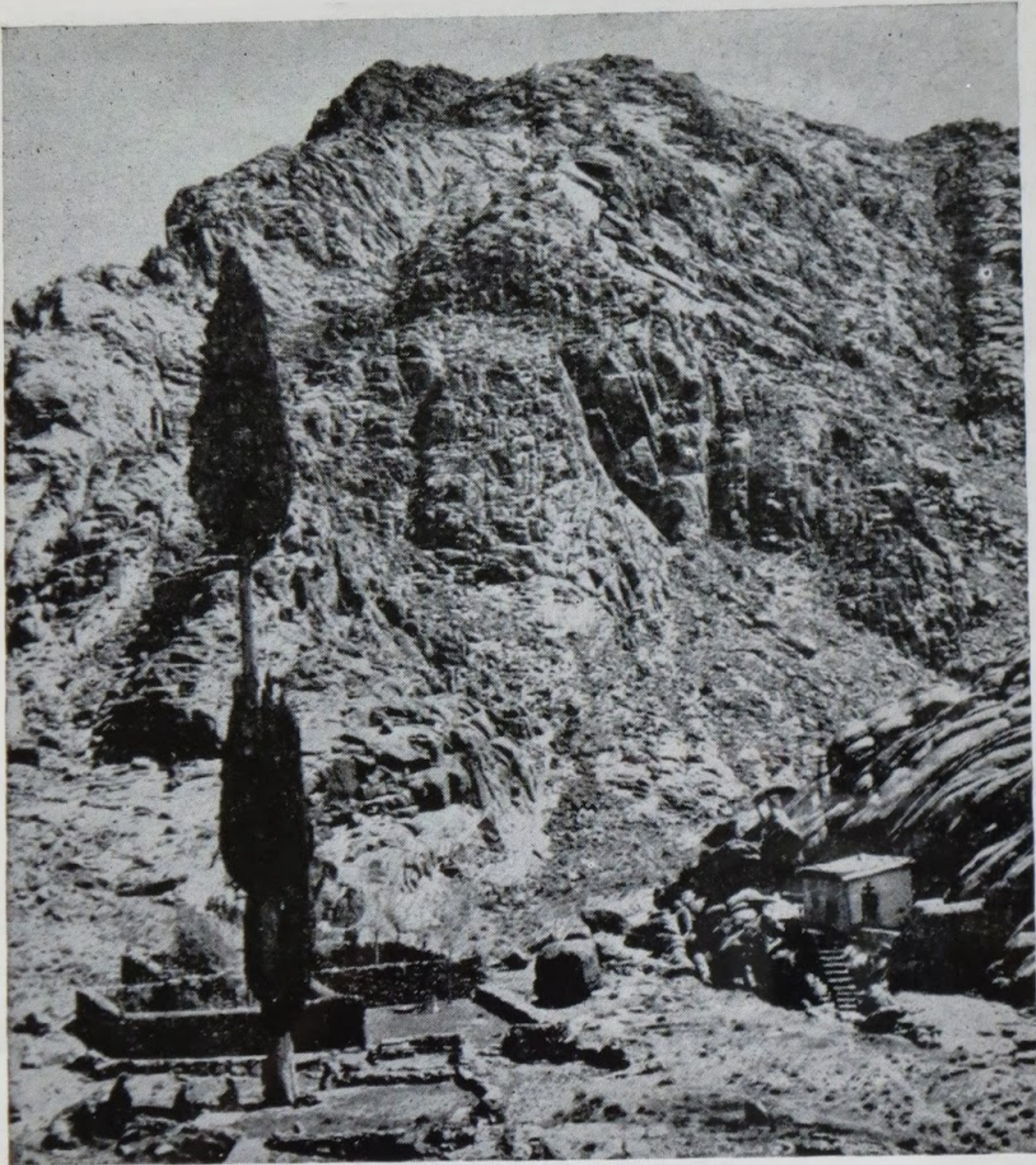
The summit of Mt. Sinai, seen from the plateau where the Lord God appeared to the Prophet Elias (III Kings 19: 4-18)

On the Red Sea, two days' journey from Mt. Sinai, there existed in St. John's day the Monastery of Raithu, now in ruins, which was in constant and close contact with the Monastery of Mt. Sinai. The abbot and brethren of this monastery, knowing the spiritual height of St. John as a "truly great leader of all who have chosen the angelic life" of monasticism, begged him to write for them "a book like the divinely-written tablets of Moses, for the instruction of the New Israelites," a book which "like a ladder set up, will lead aspirants to the gate of heaven." In answer to their request, St. John wrote the book which has been of such great benefit to generations of Christians, known to all as the Ladder .