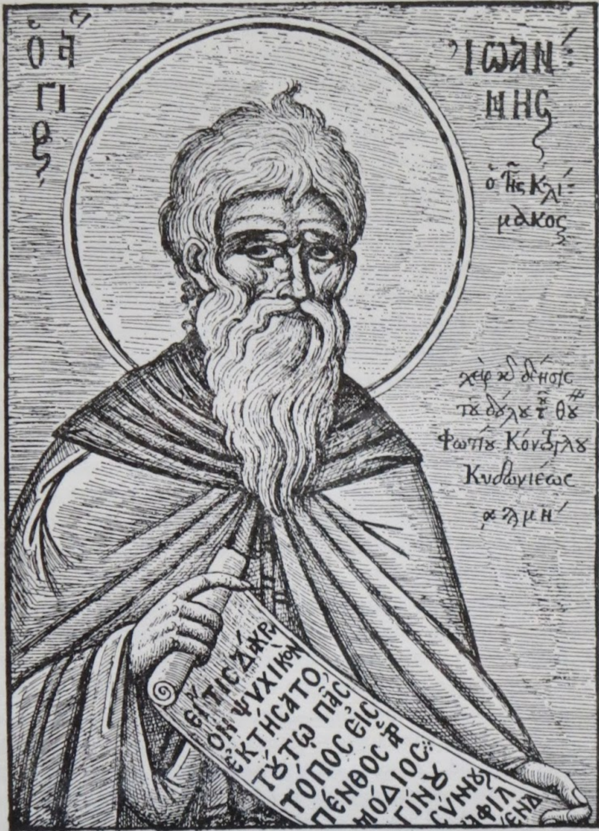
Icon by Photios Kontoglou