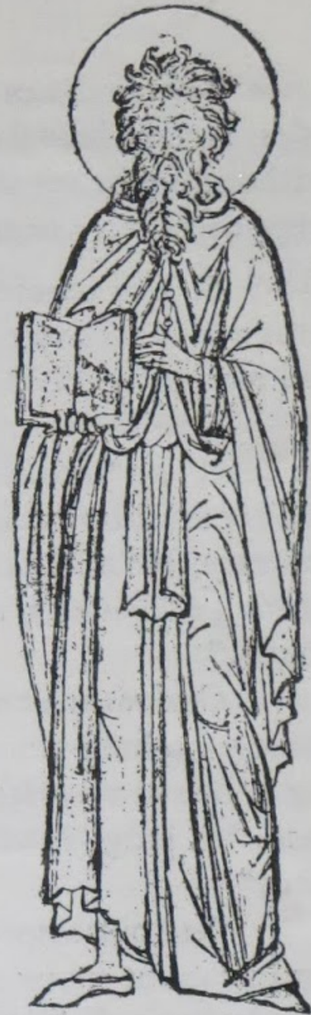
St. John Climacus (13th-century manuscript)

There are various stages of lamentation: lamentation that comes from fear, or lamentation that comes from mercifulness; and there is also a lamentation that comes from love.