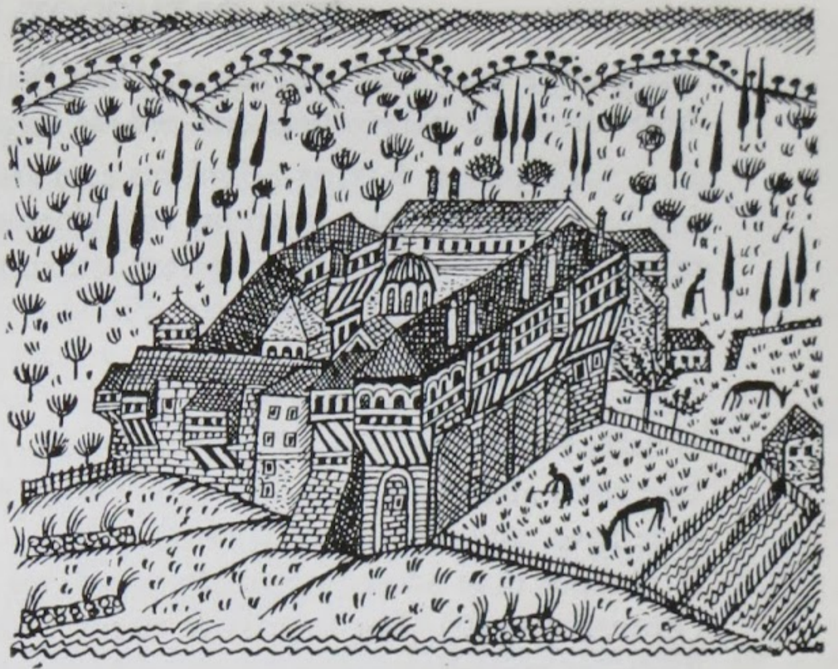
The Monastery of Philotheus. Drawing by Photios Kontoglou