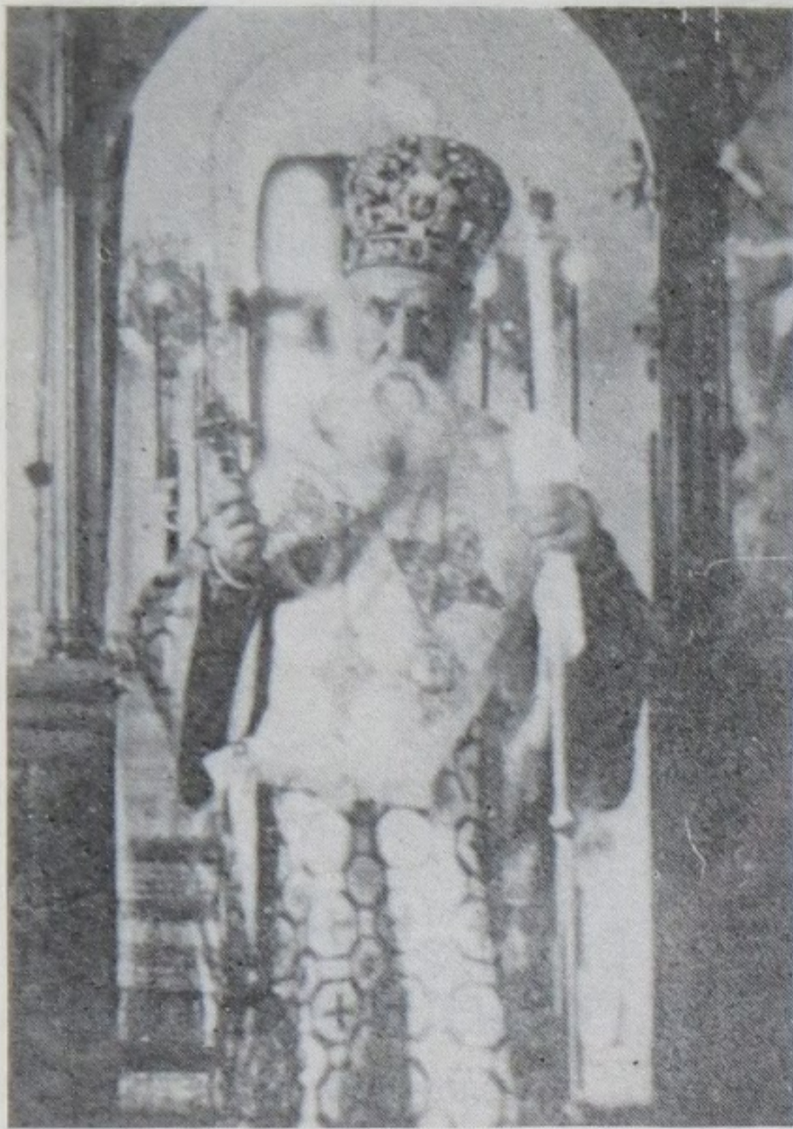
St. Nectarios (1920)