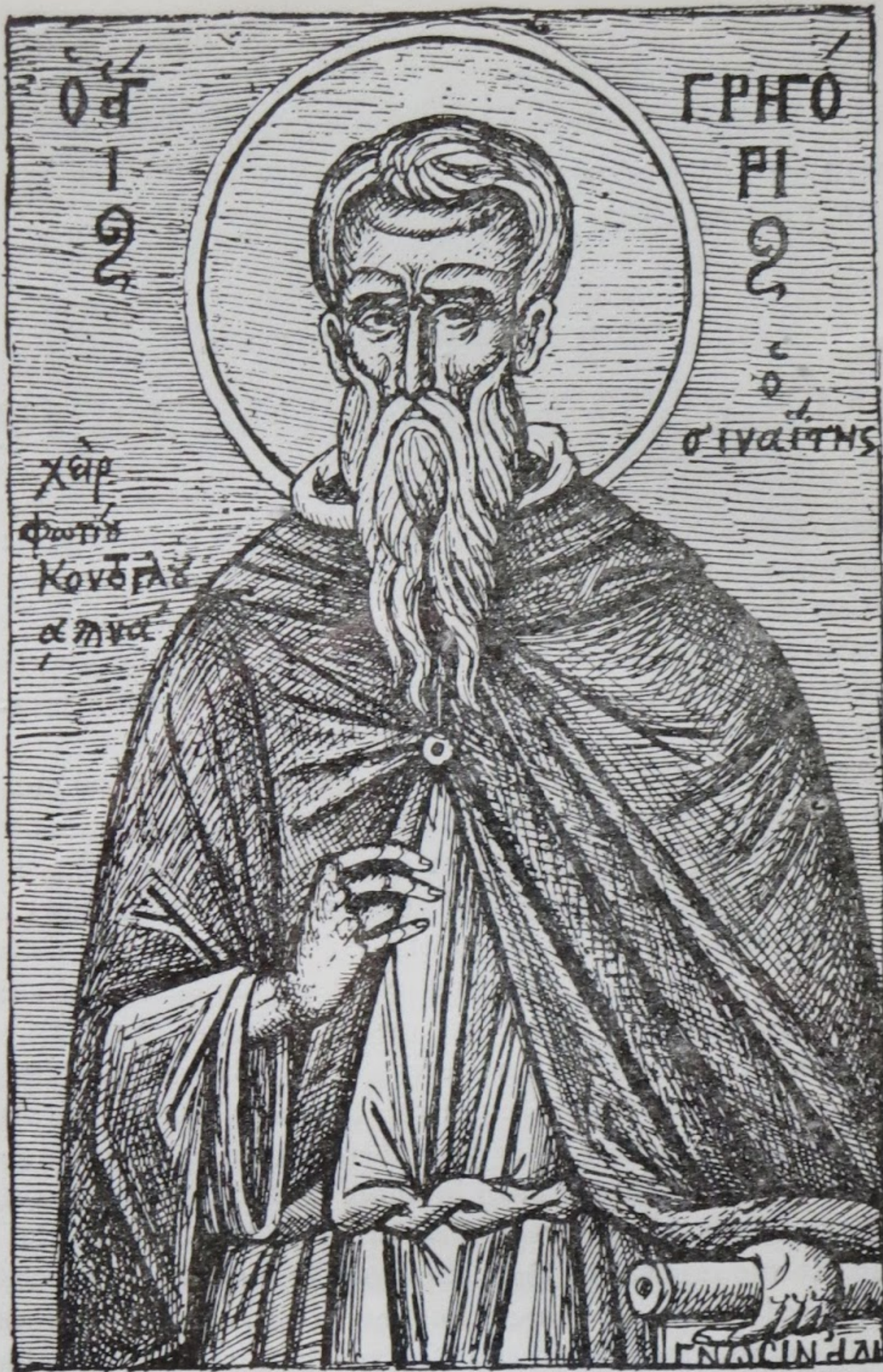
Icon by Photios Kontoglou