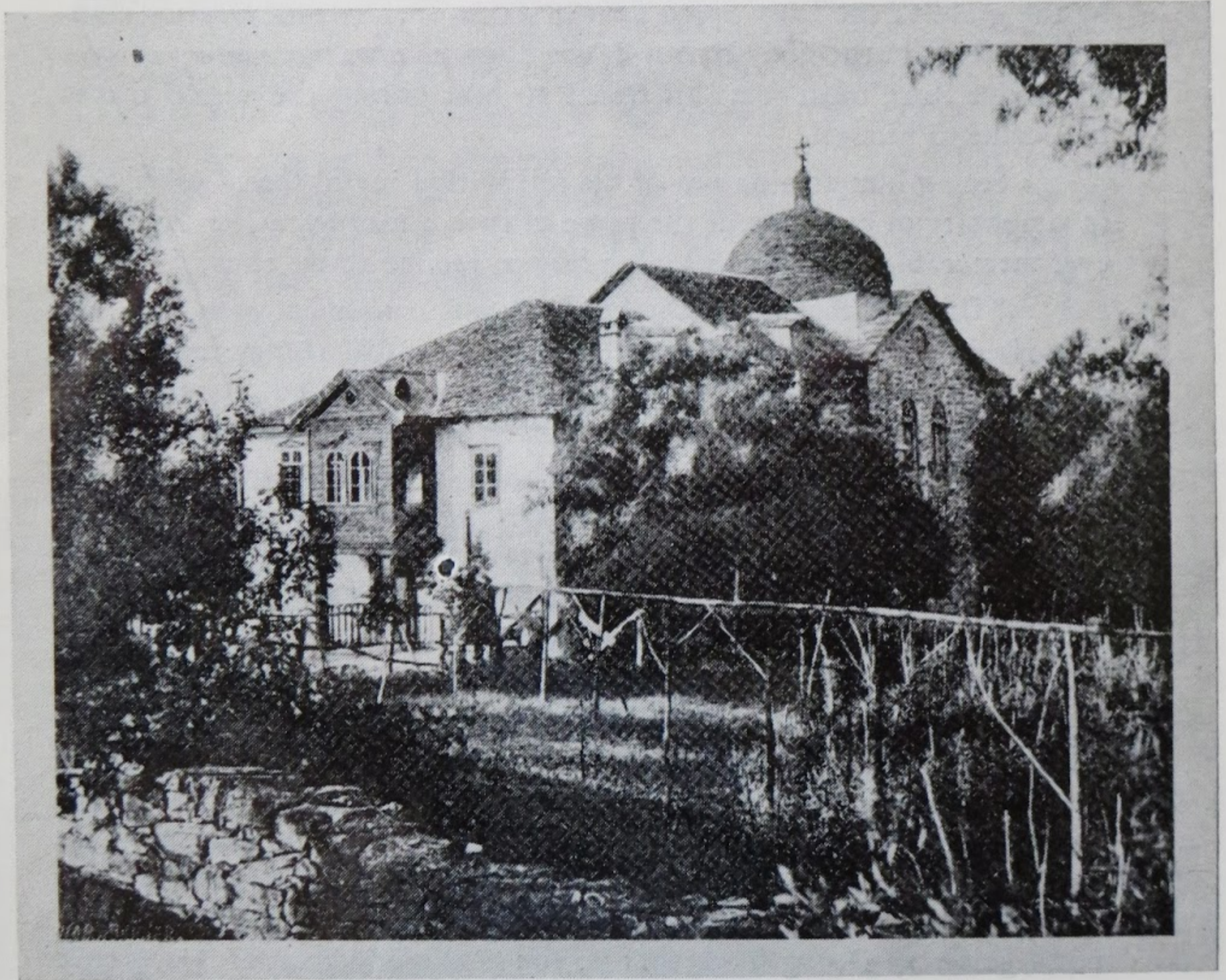
The Magula Hermitage, as photographed at the turn of this century