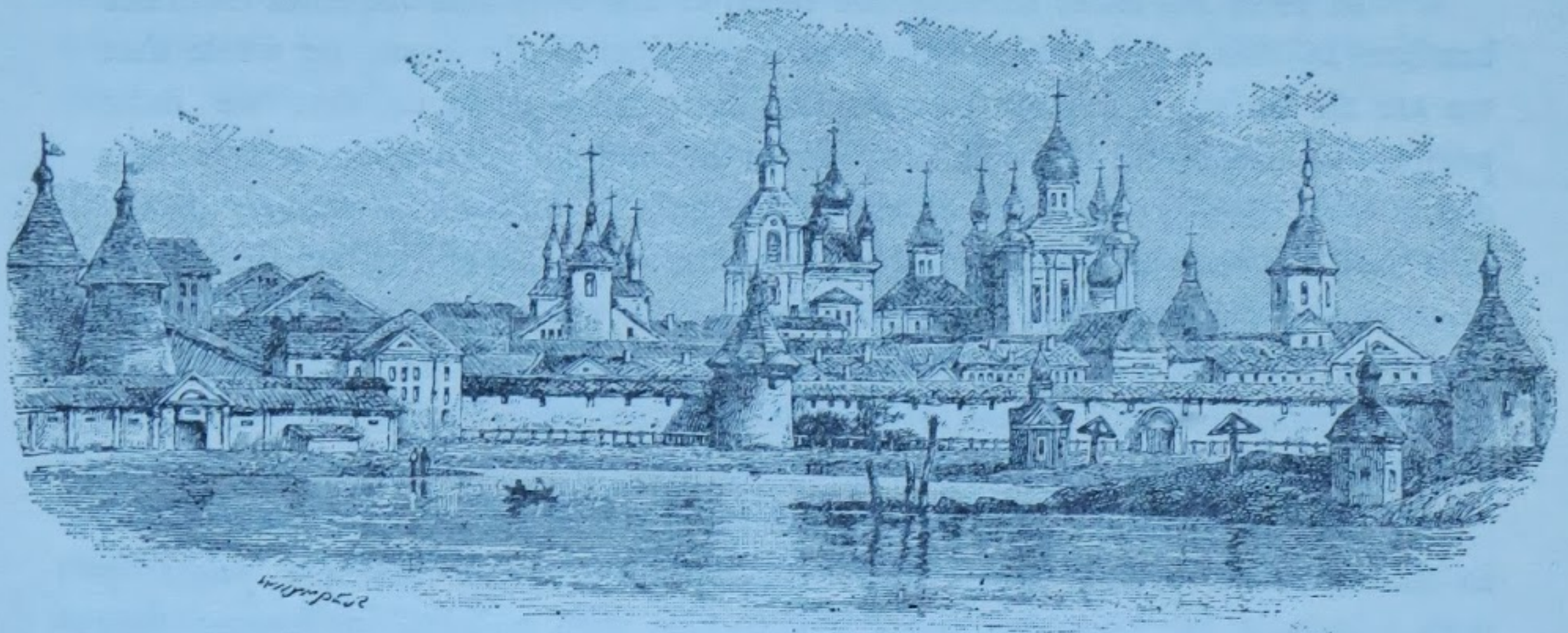
THE SOLOVETSK MONASTERY.