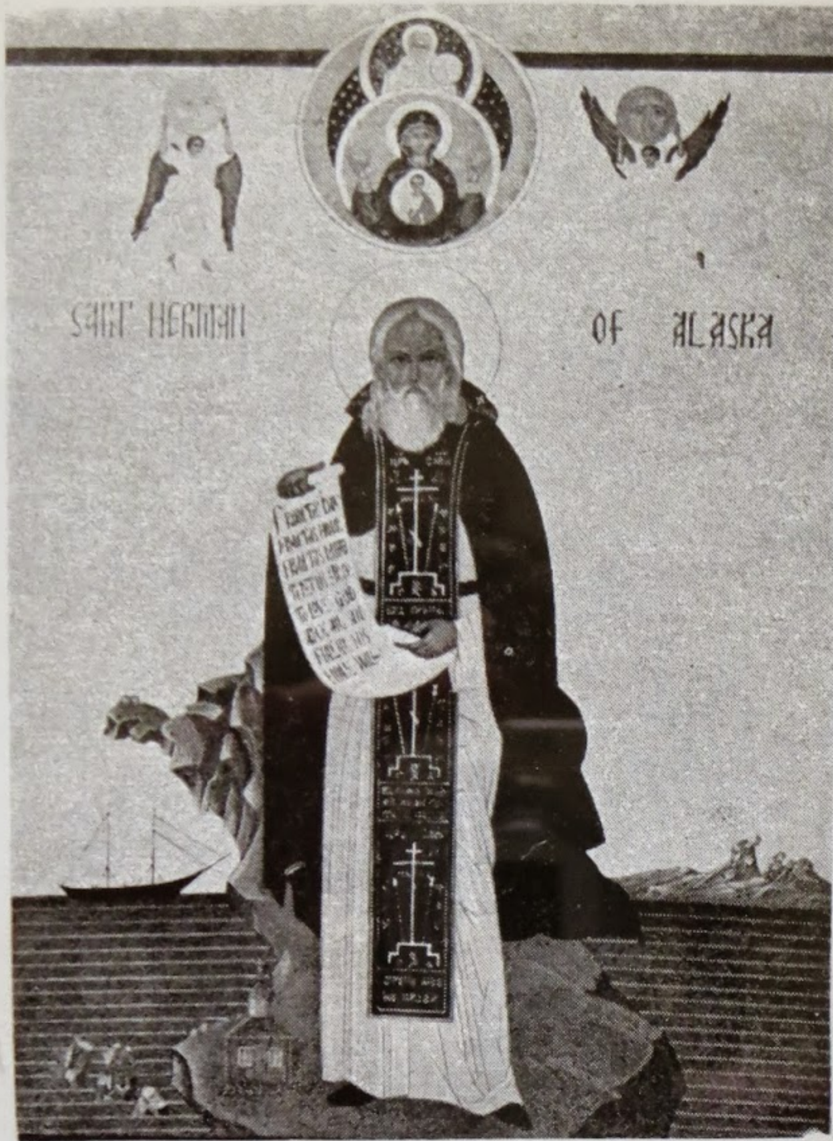
SAINT HERMAN, SCANDINAVIAN ICON

wild and little-accessible Spruce Island, surrounded by the constantly raging ocean, the path of people to it has not been overgrown. Although it is difficult to get to his grave because of the craggy, surf-drenched shores and the want of a suitable bay, nonetheless the infirm have been drawn to his grave in expectation of blessed help by his intercession in prayer before the Throne of God, in various sufferings, in grief and need, in sorrows and afflictions. And their labors and hopes have not been in vain.