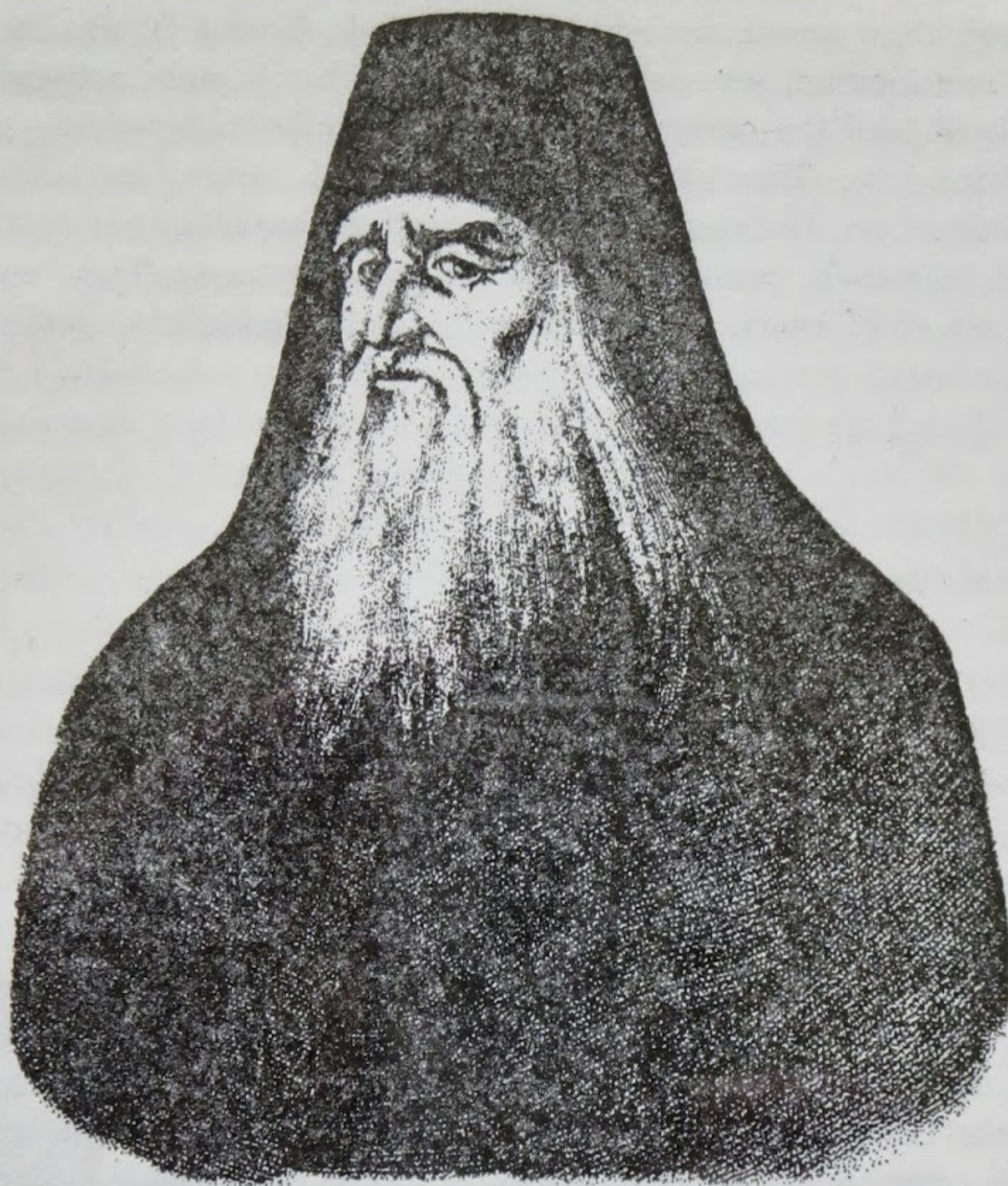
BLESSED NAZARIUS, ABBOT OF VALAAM