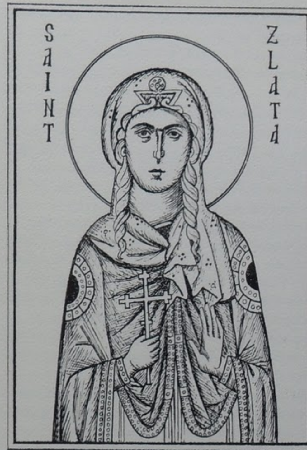
THE HOLY NEW-MARTYR ZLATA Commemorated on October 13