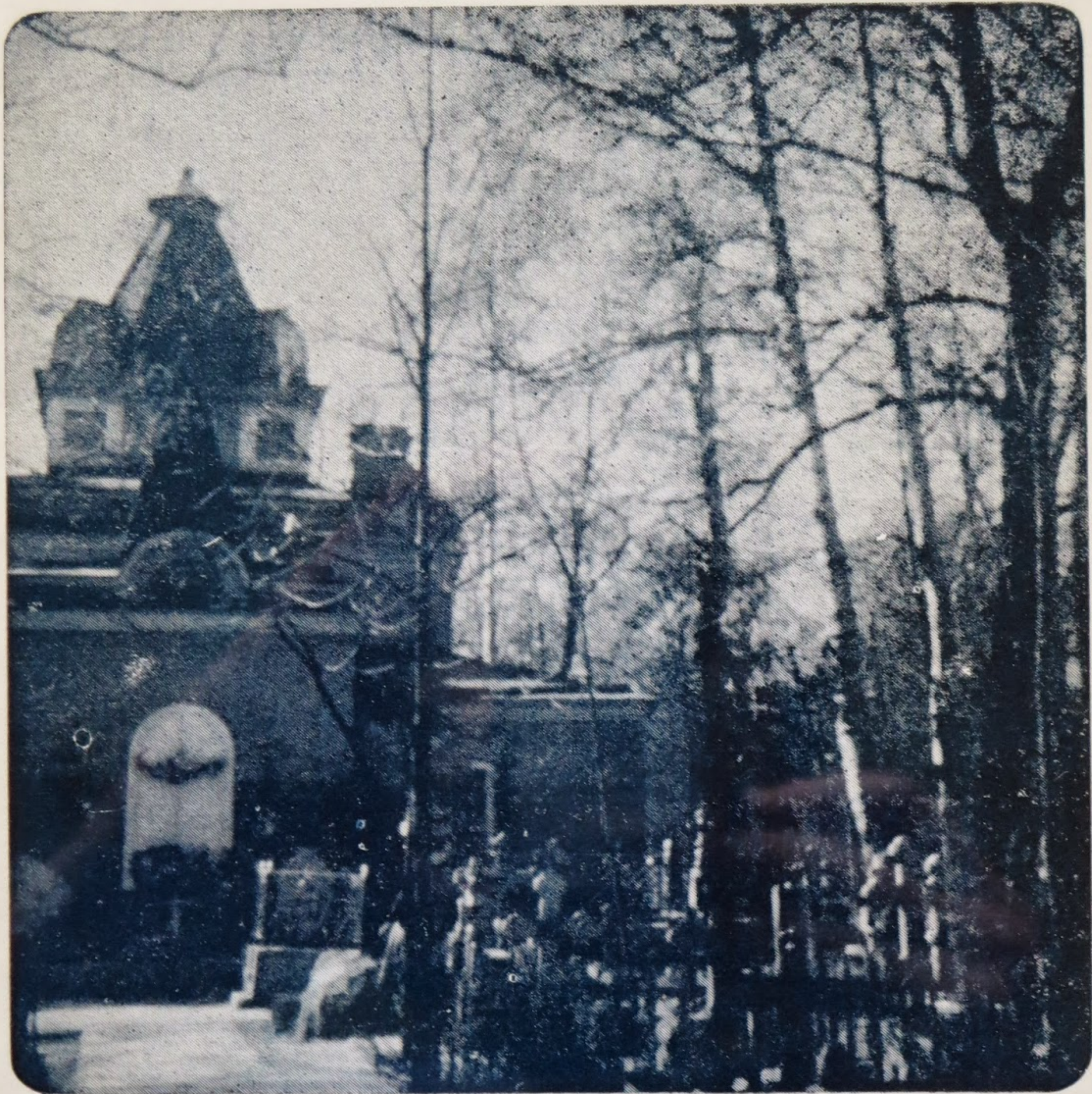
The Chapel over the relics of Blessed Xenia in the Smolensk Cemetery in Petersburg