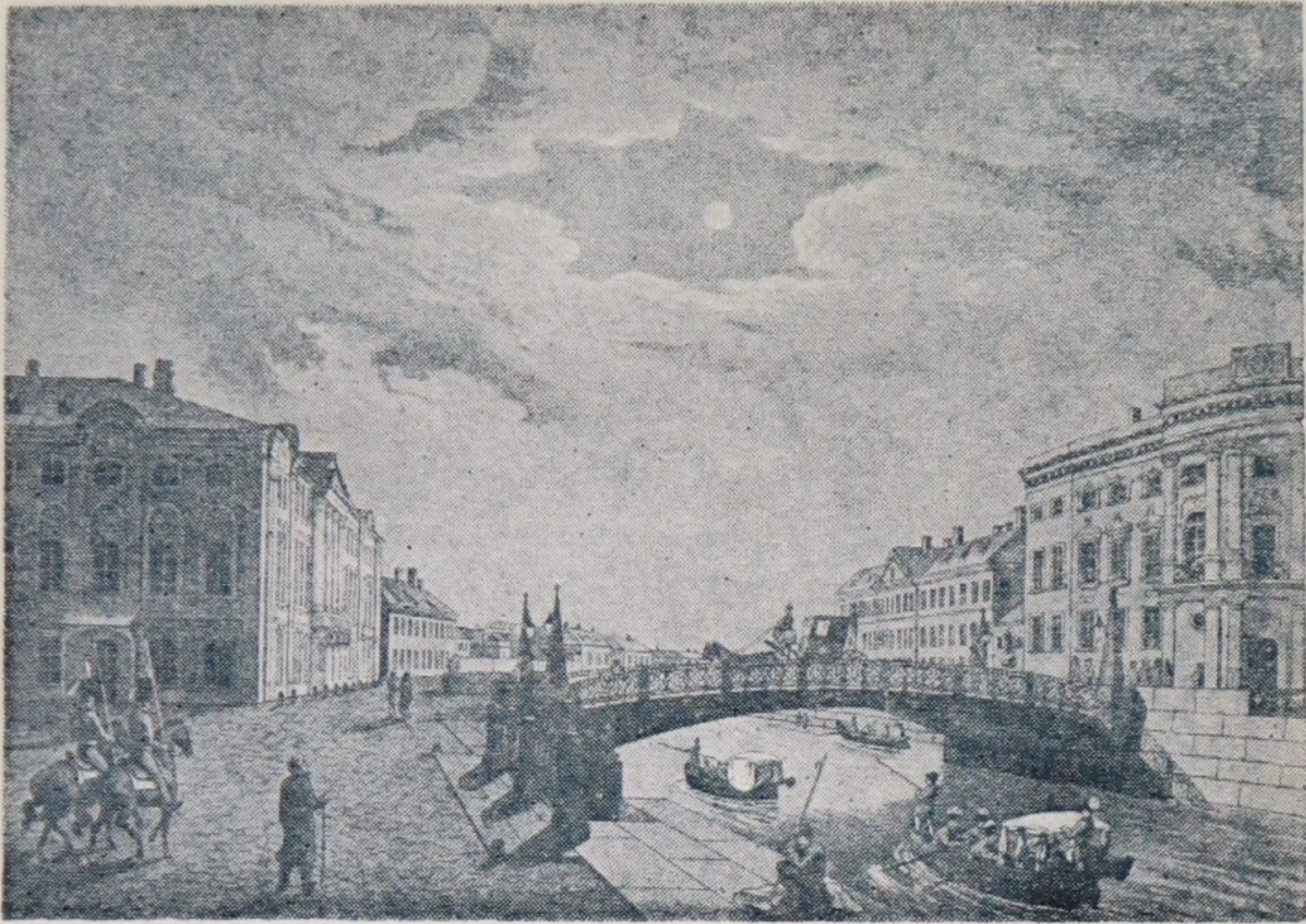
Petersburg — the Nevsky Prospect in Blessed Xenia's time