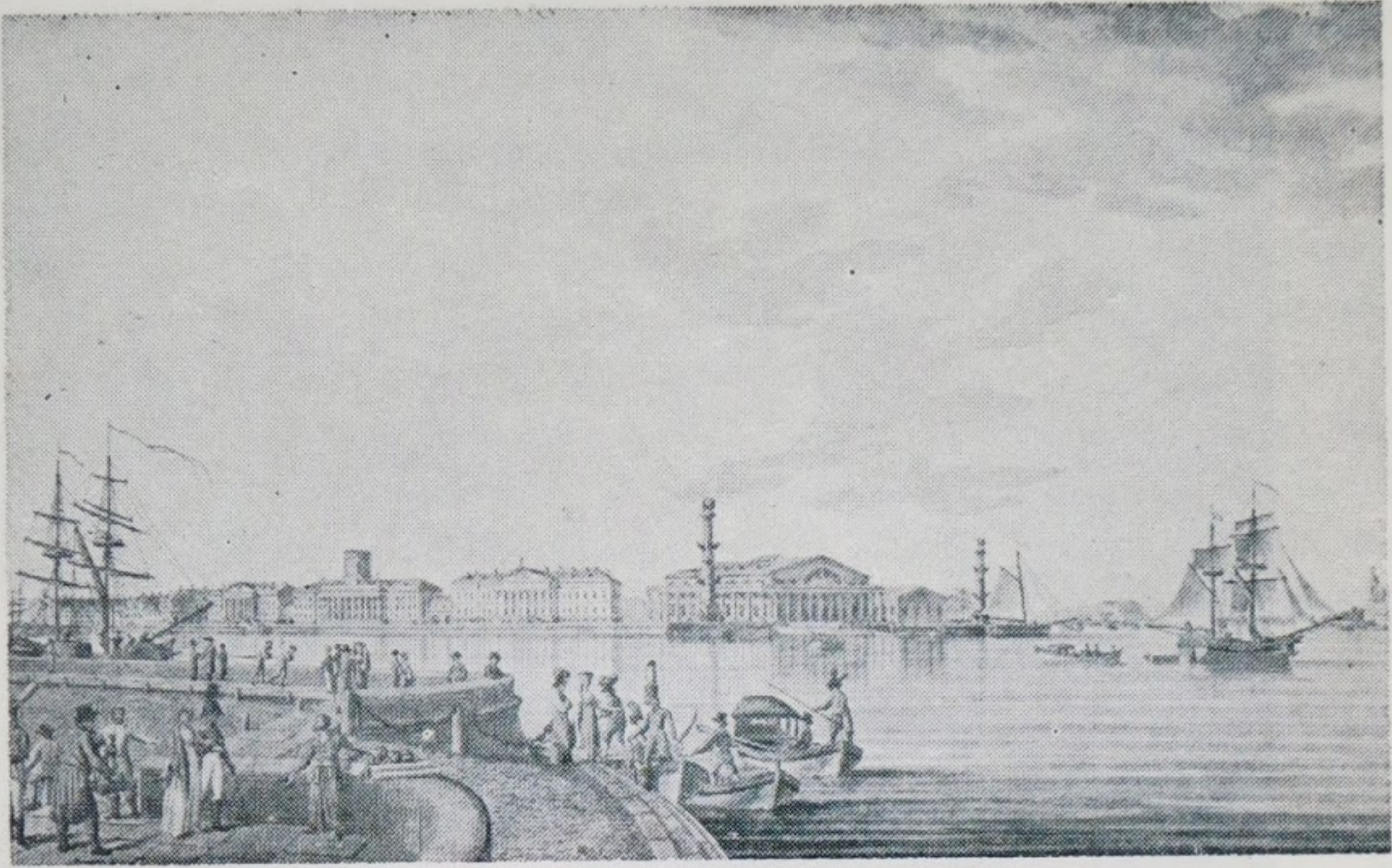
The Port of Petersburg in Blessed Xenia's time