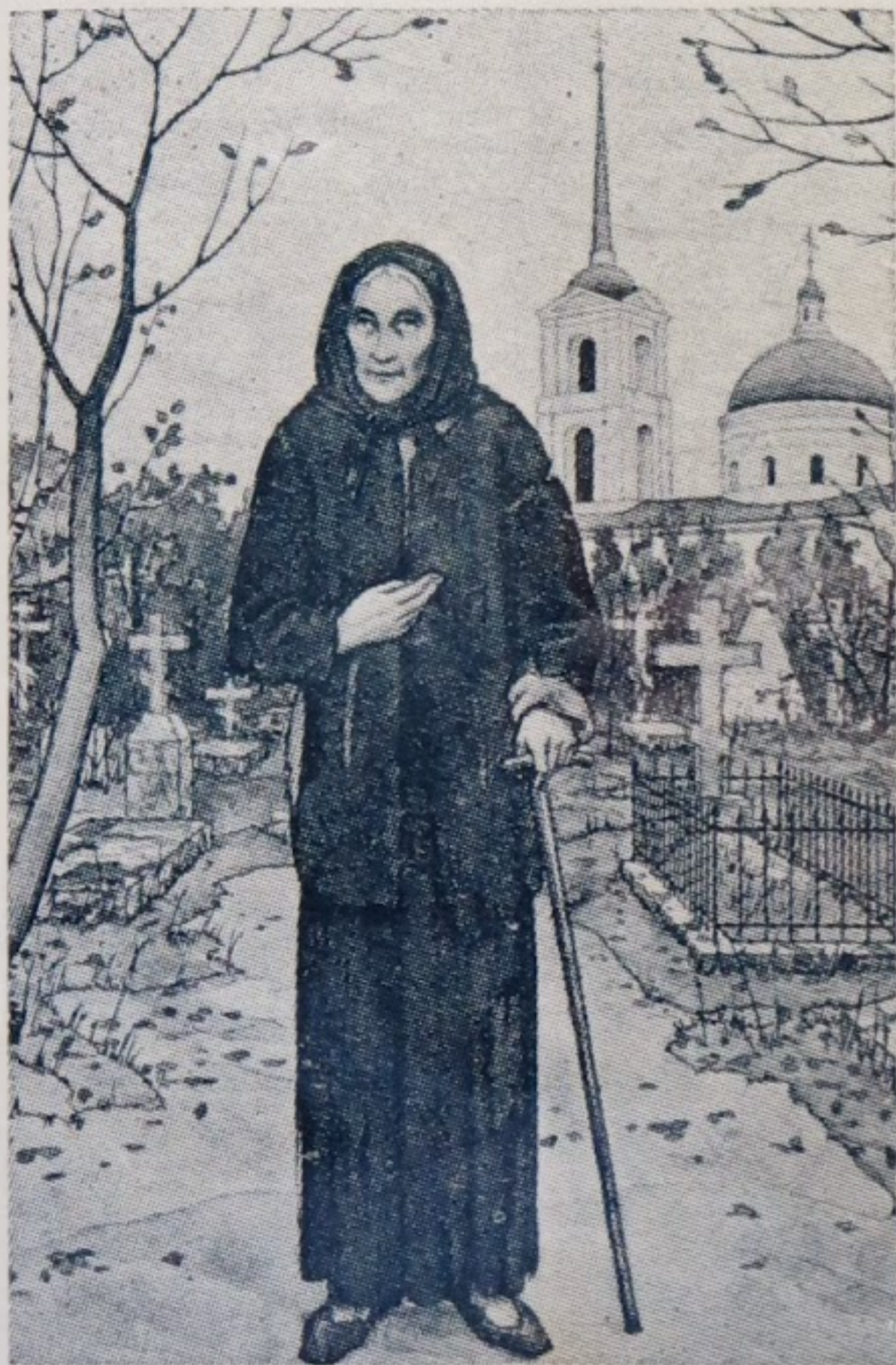
Bl. Xenia — depiction by new martyr Nun Mariamna of Kiev