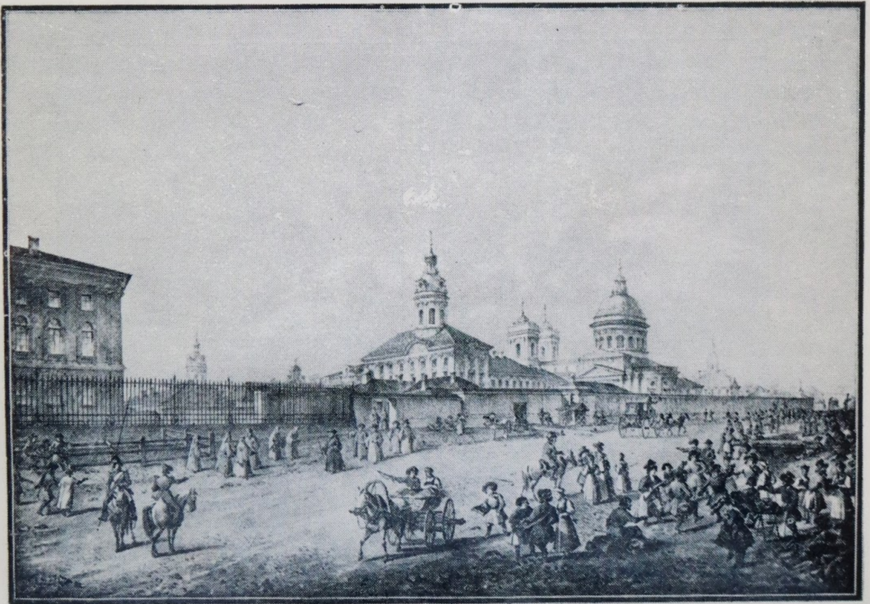
St. Alexander Nevsky Lavra in Petersburg, 18th century engraving