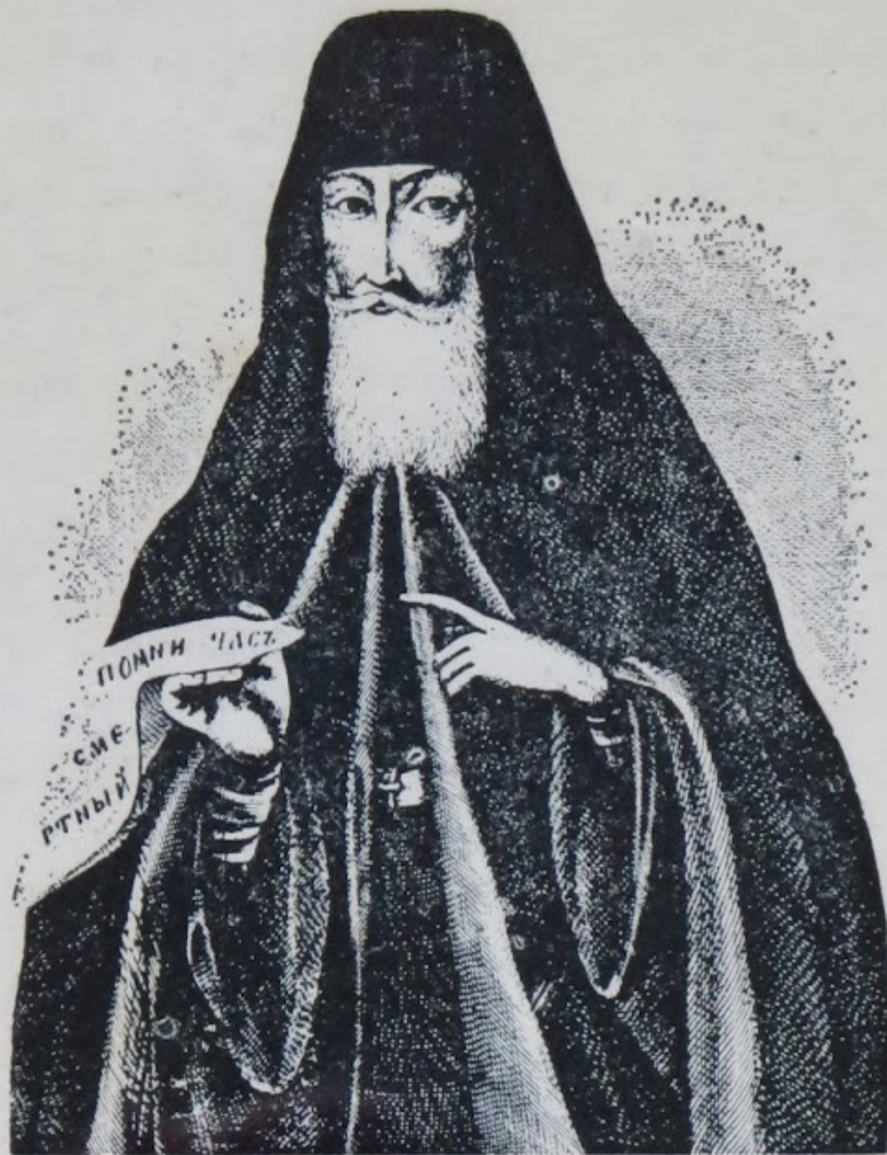
Elder Theodore of Sanaxar