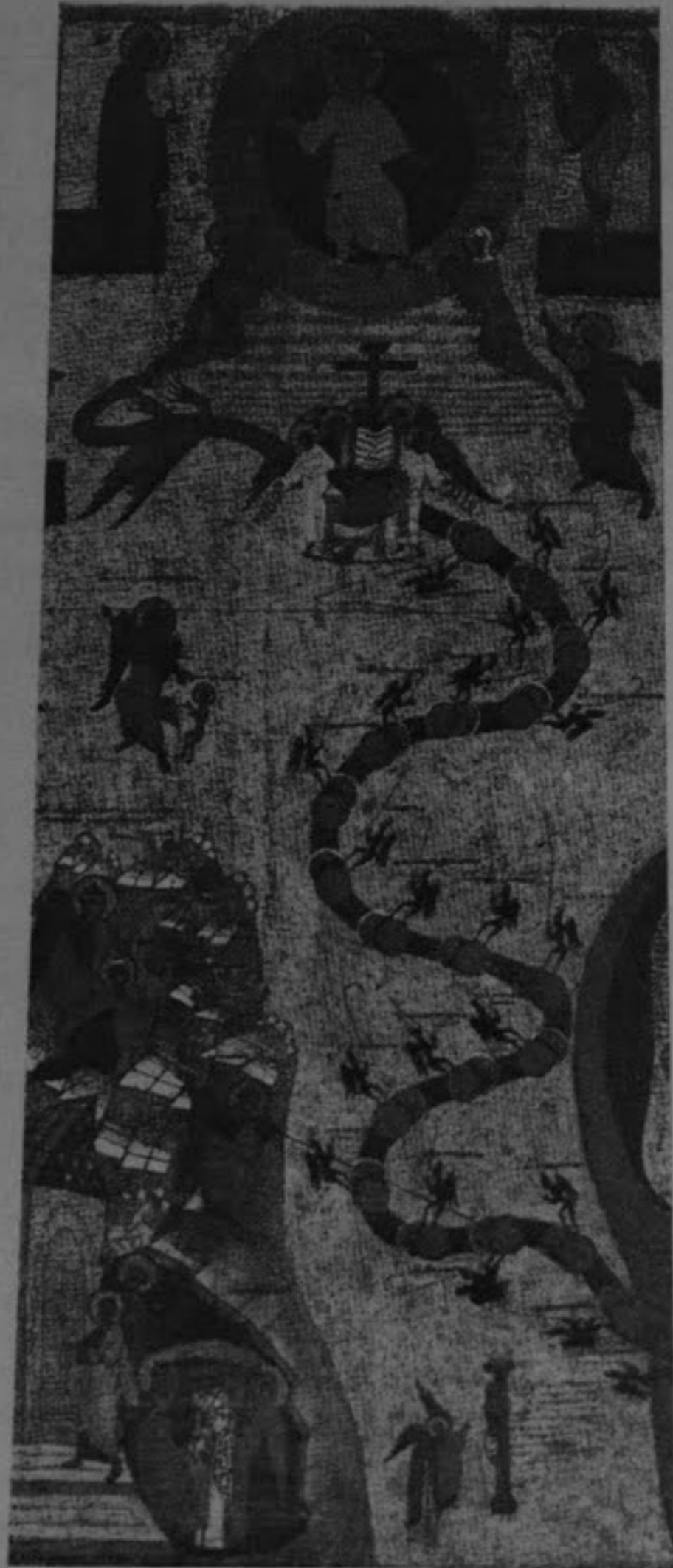
The twenty stations of the aerial toll-houses Detail of 16th-century Novgorod icon, Hann Collection, Pittsburgh, Pa.