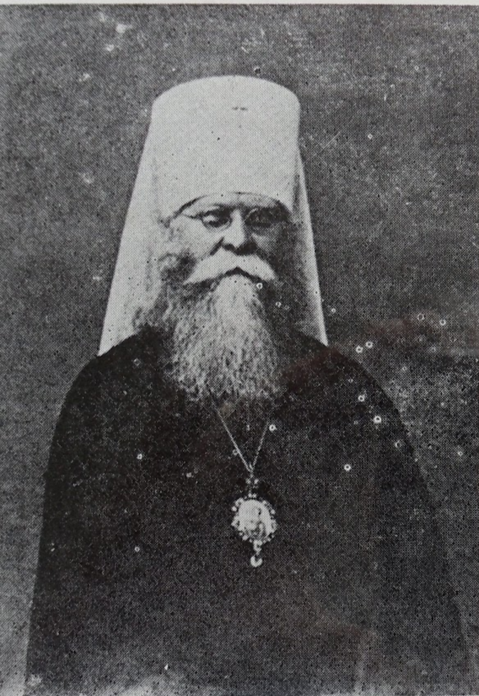
Metropolitan Joseph of Petrograd See The Orthodox Word, No. 36,