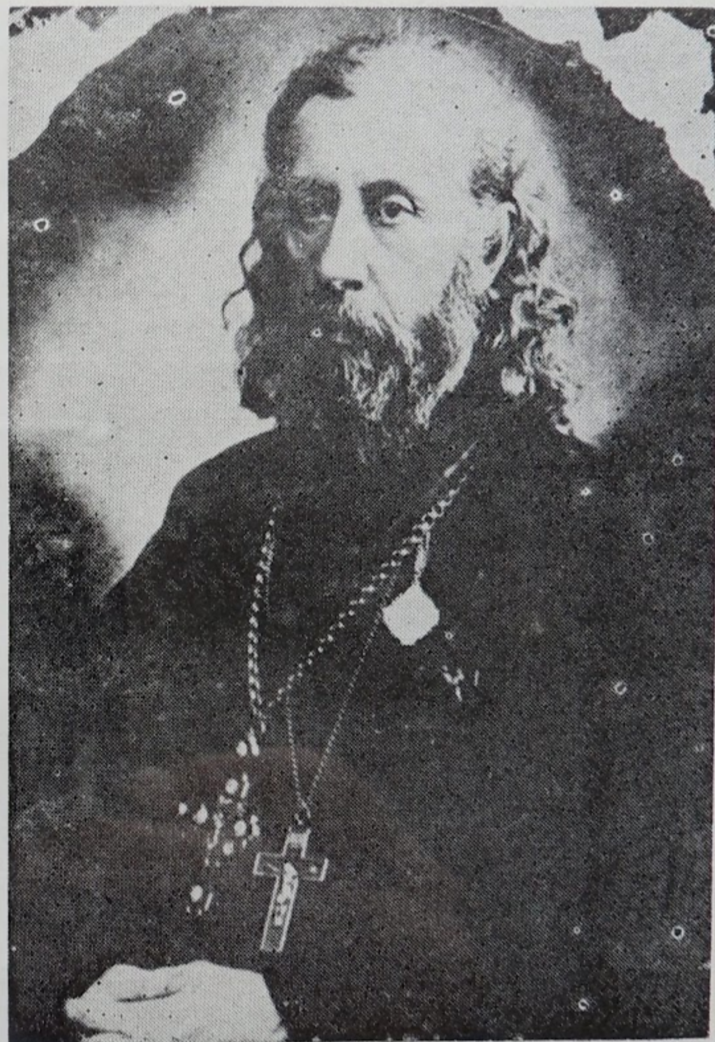
Archbishop Dimitry of Gdov See The Orthodox Word, No. 37,

AMONG THE FOUNDING FATHERS OF RUSSIA'S CATACOMB CHURCH