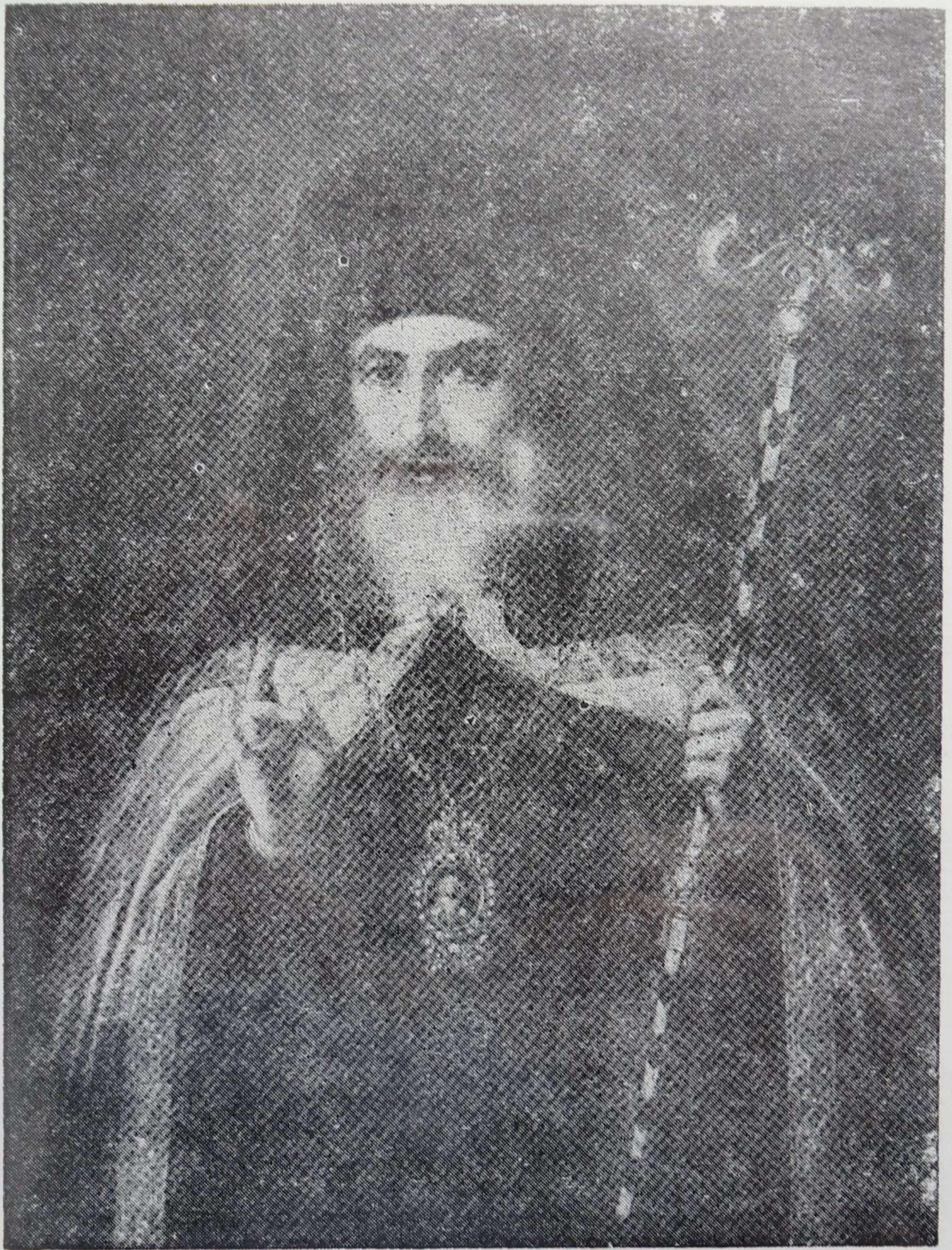
SAINT CALLINICUS A portrait from life