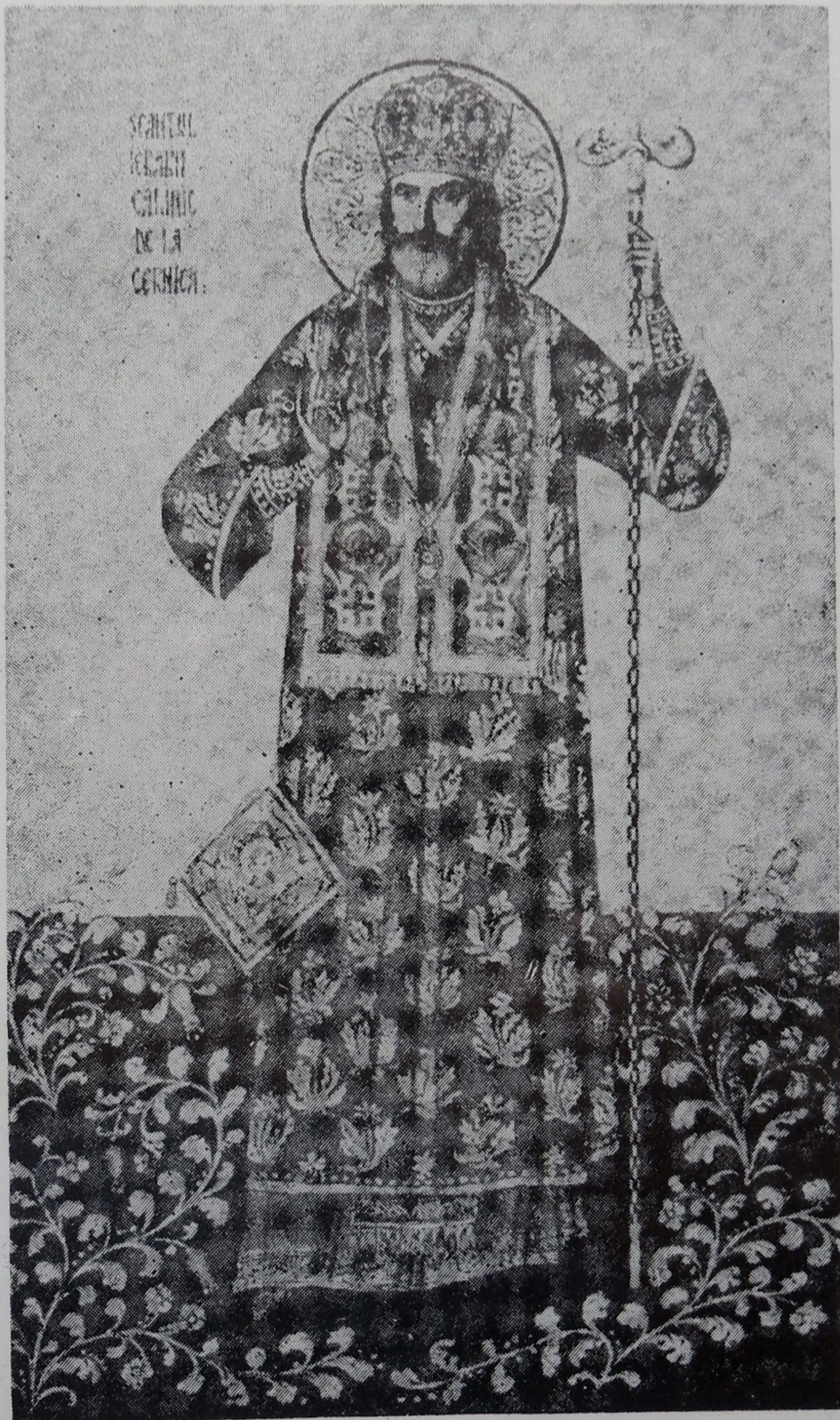
SAINT CALLINICUS OF CERNICA Commemorated on April 11