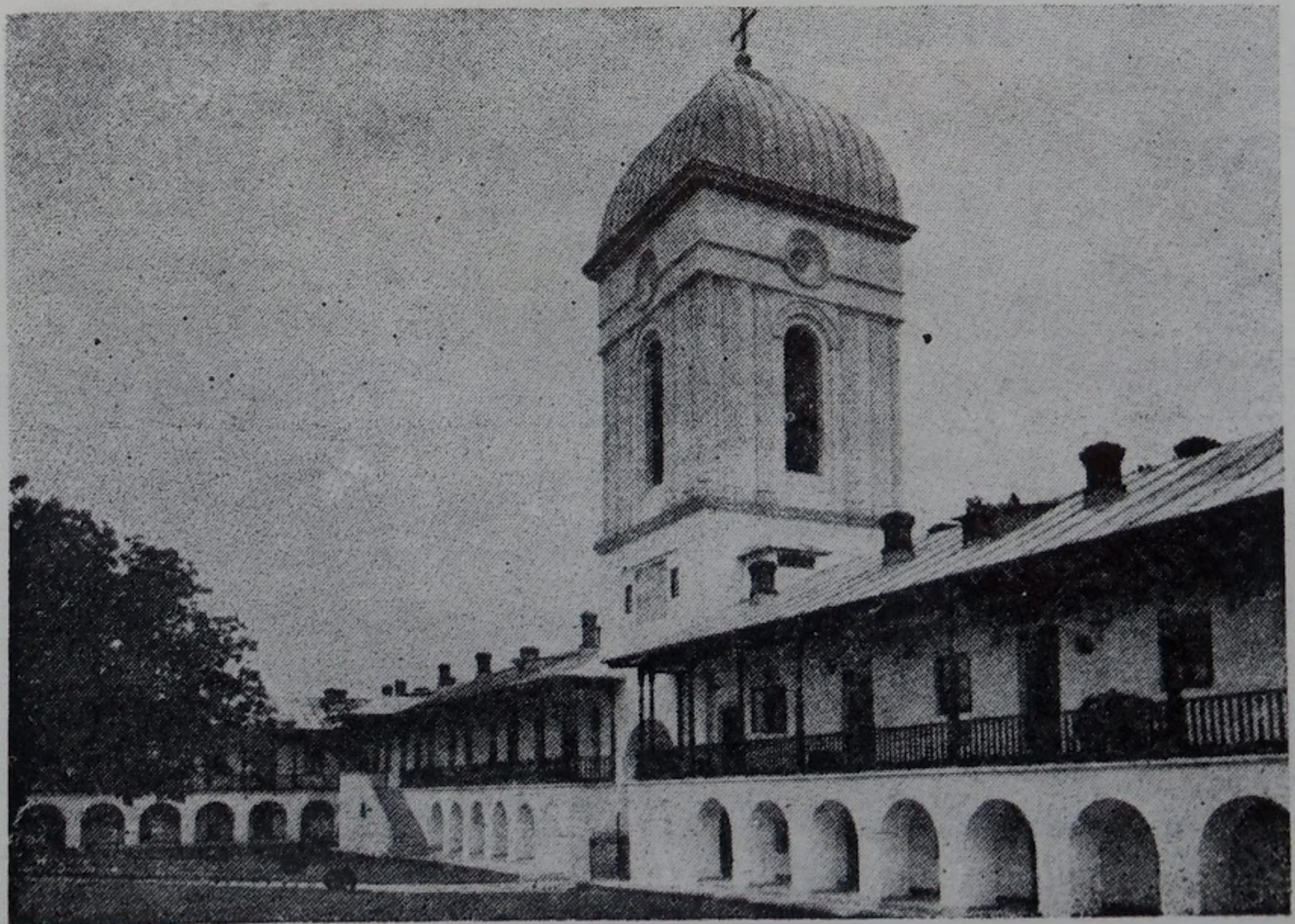
Cernica Monastery tower gate and cells