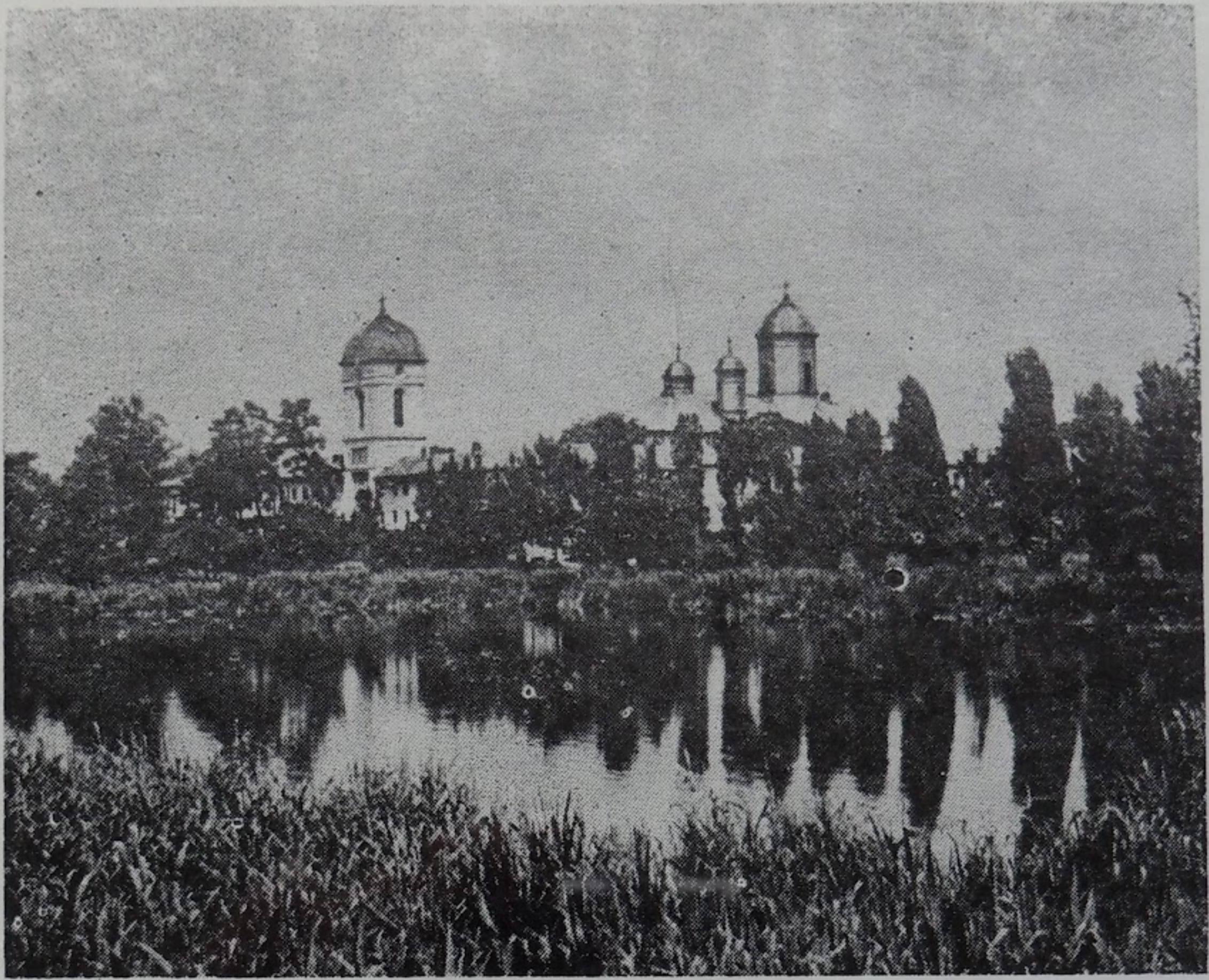
The Cernica Island Monastery A general view over the waters