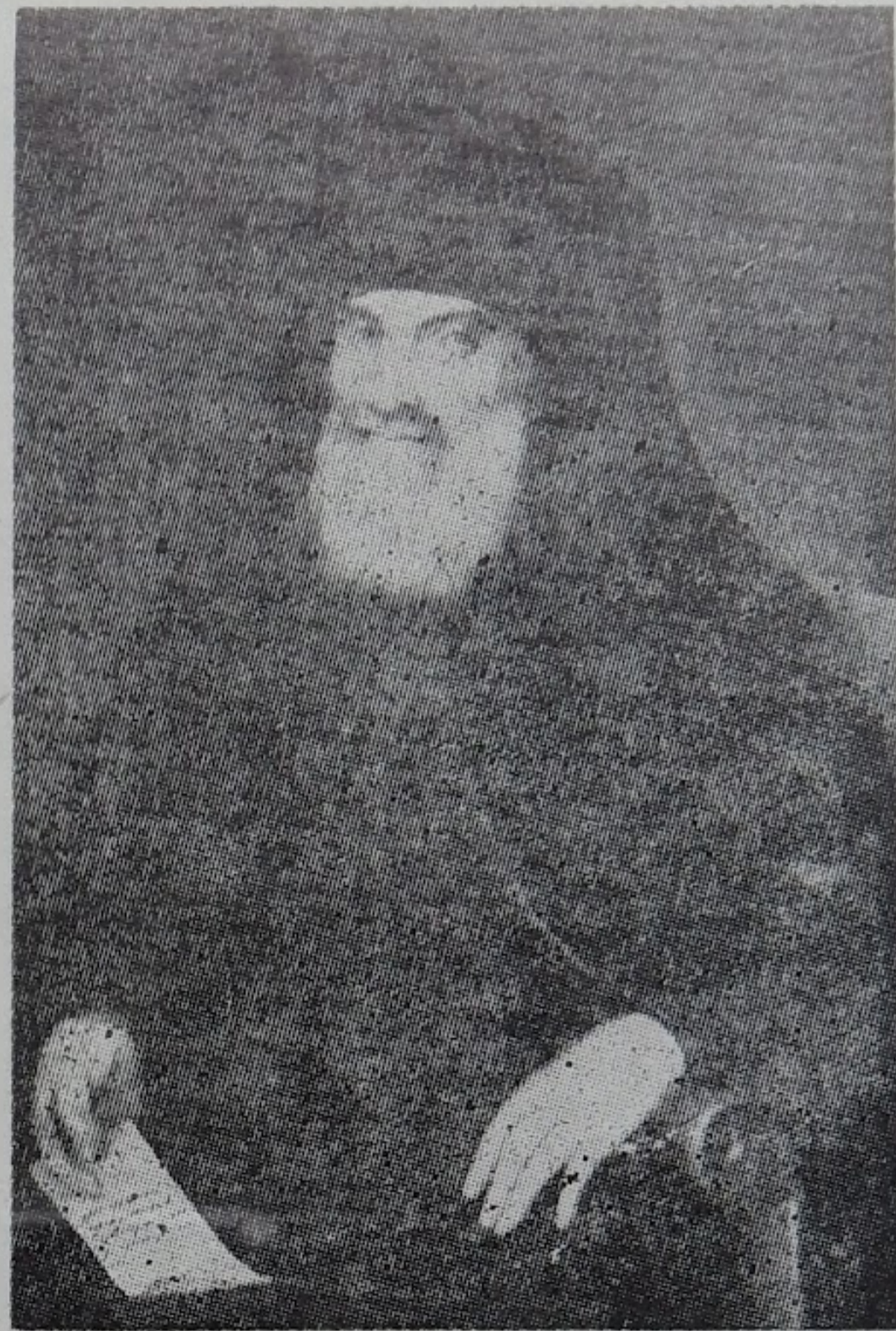
St. Callinicus in the evening of his life