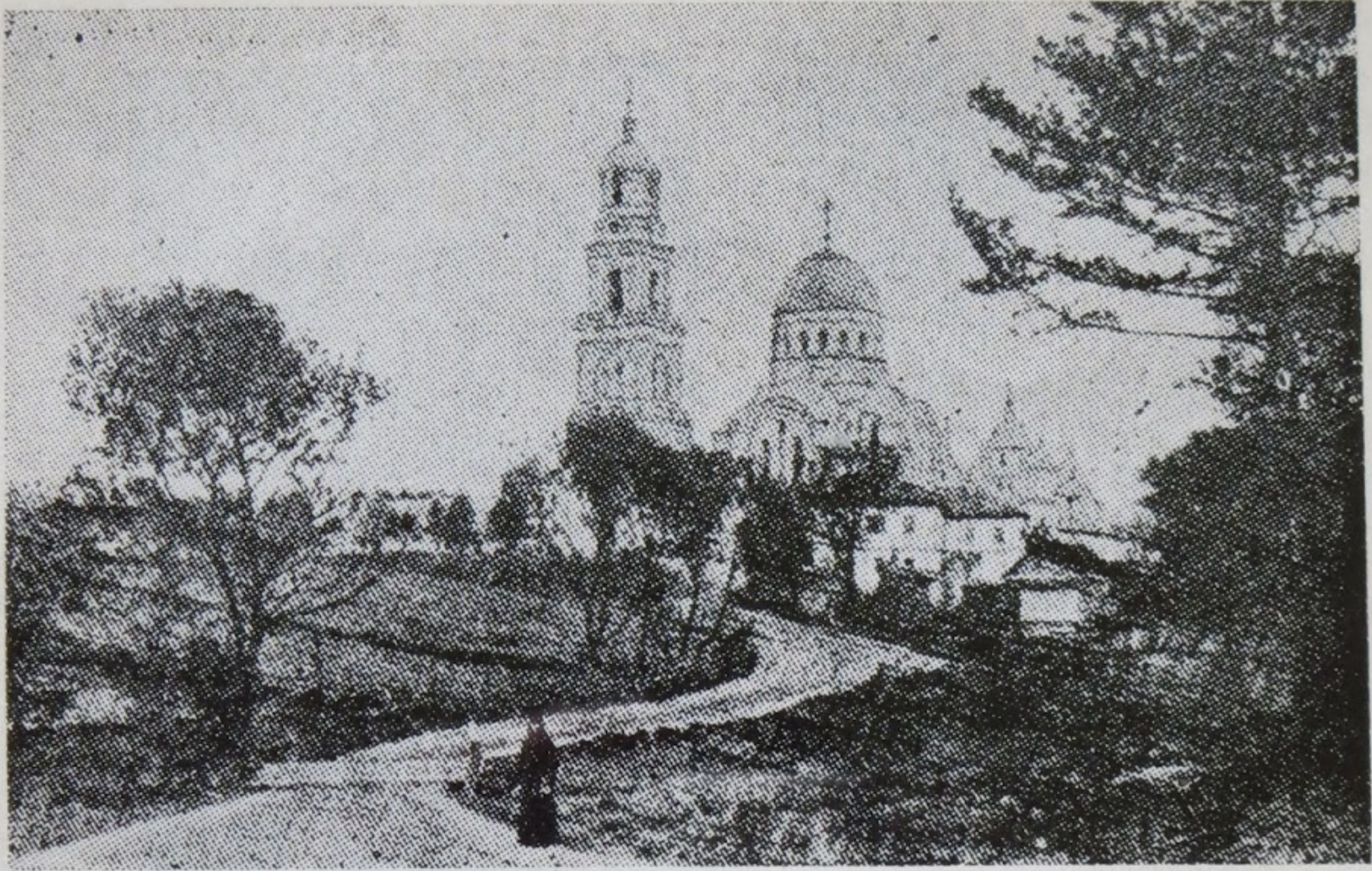
General view of St. Tikhon of Kaluga Monastery, 1913