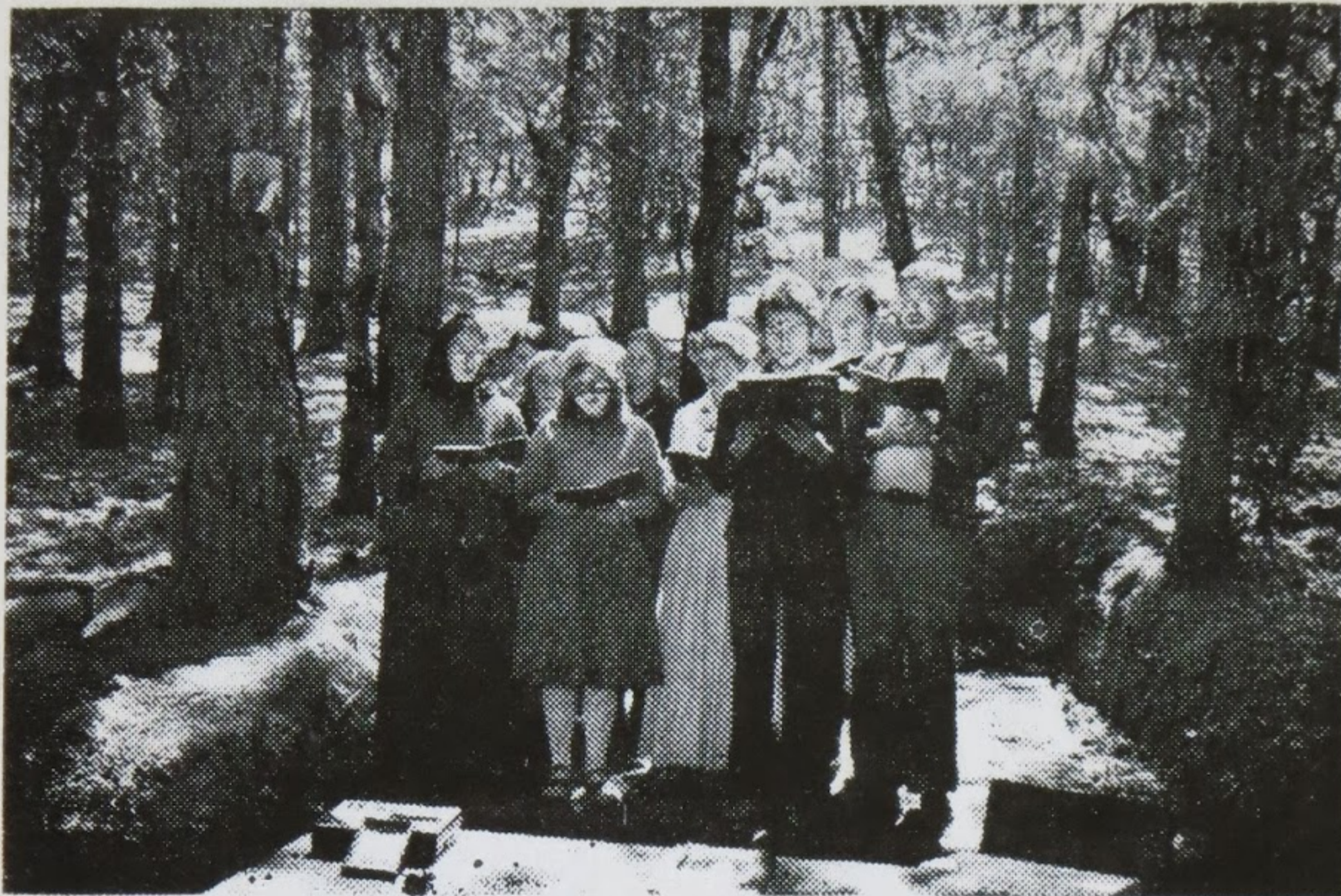
During the 1979 Pilgrimage—the choir singing