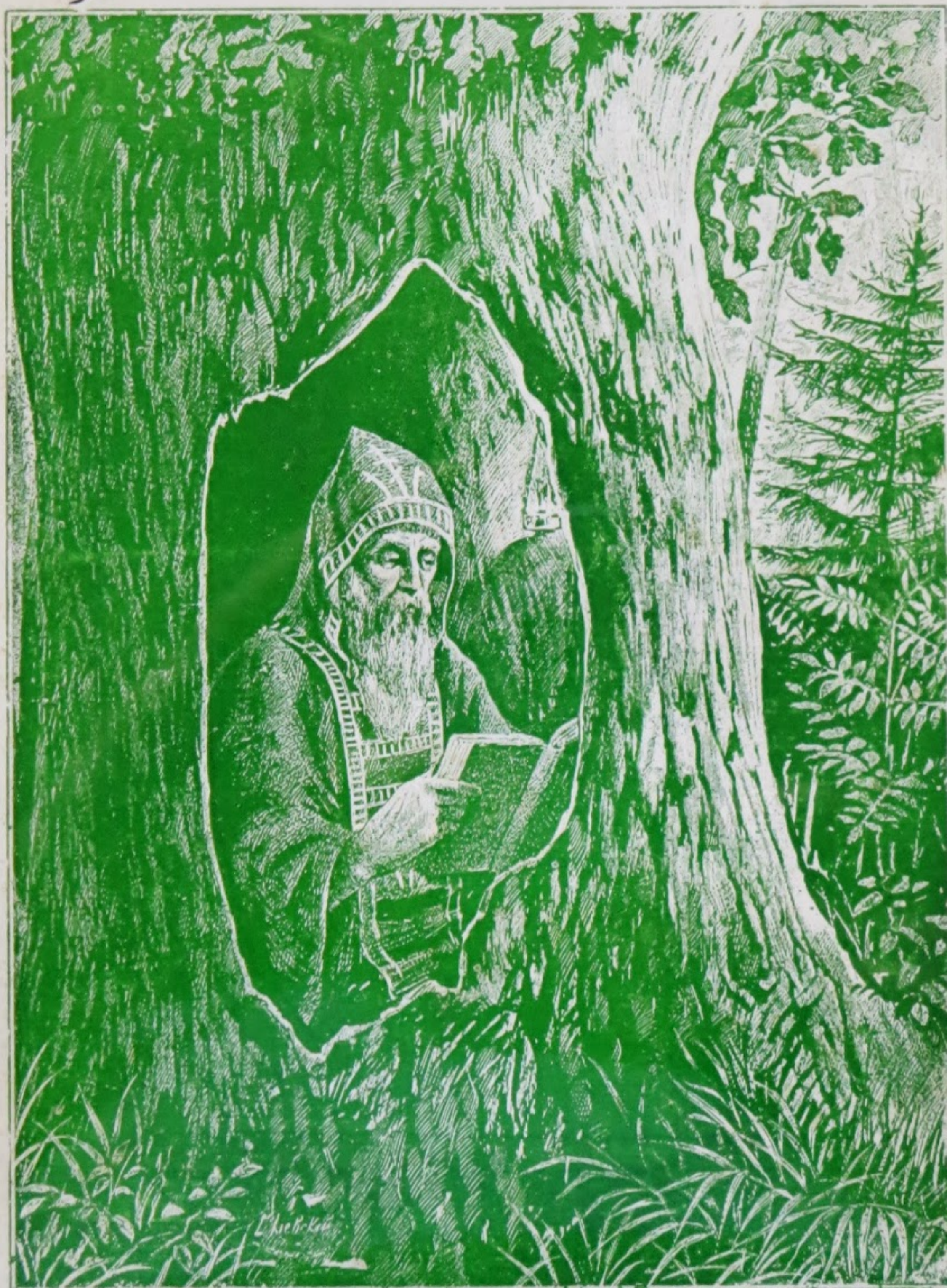
ST. TIKHON OF KALUGA