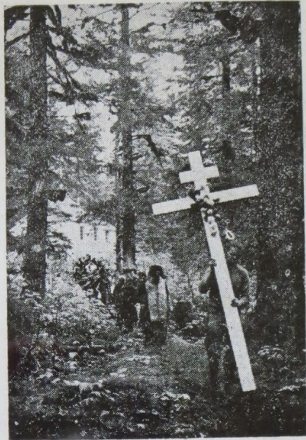
Funeral procession with Fr. Gerasim's Cross