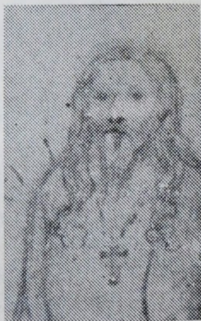
Fr. Nikon of Optina