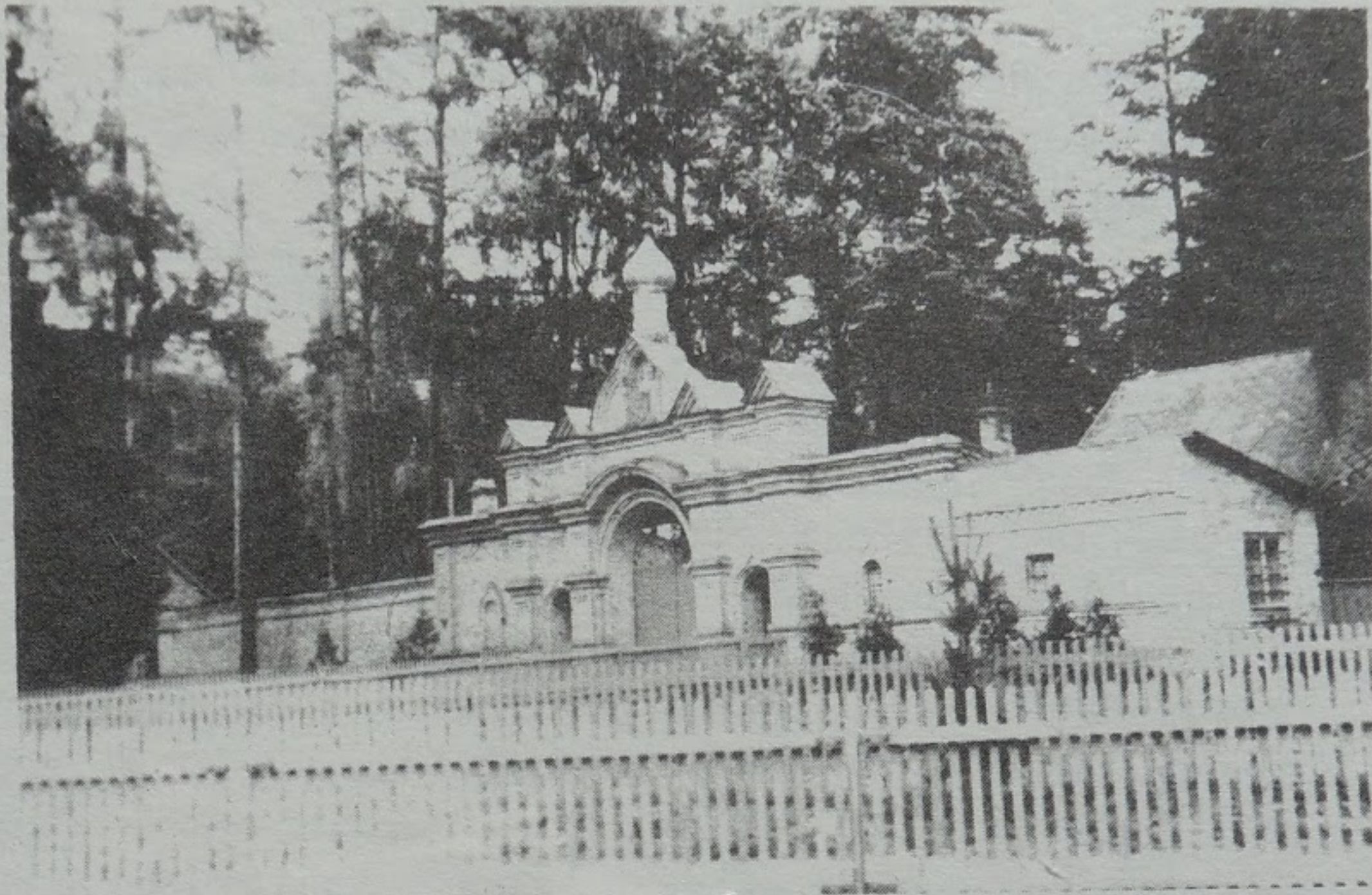
The Riga Convent.