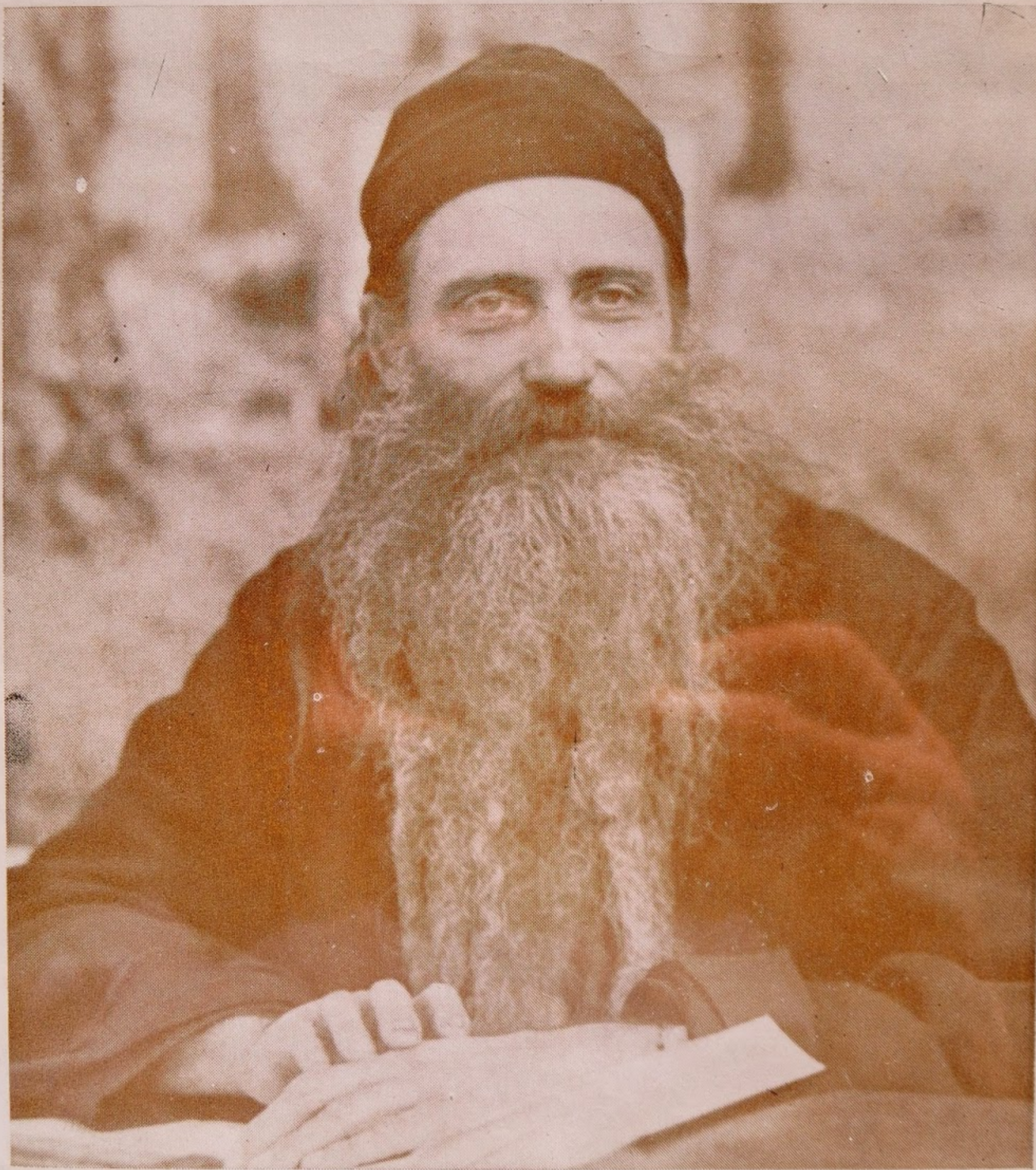
Hieromonk Seraphim Rose, instructing at the New Valaam Theological Academy.