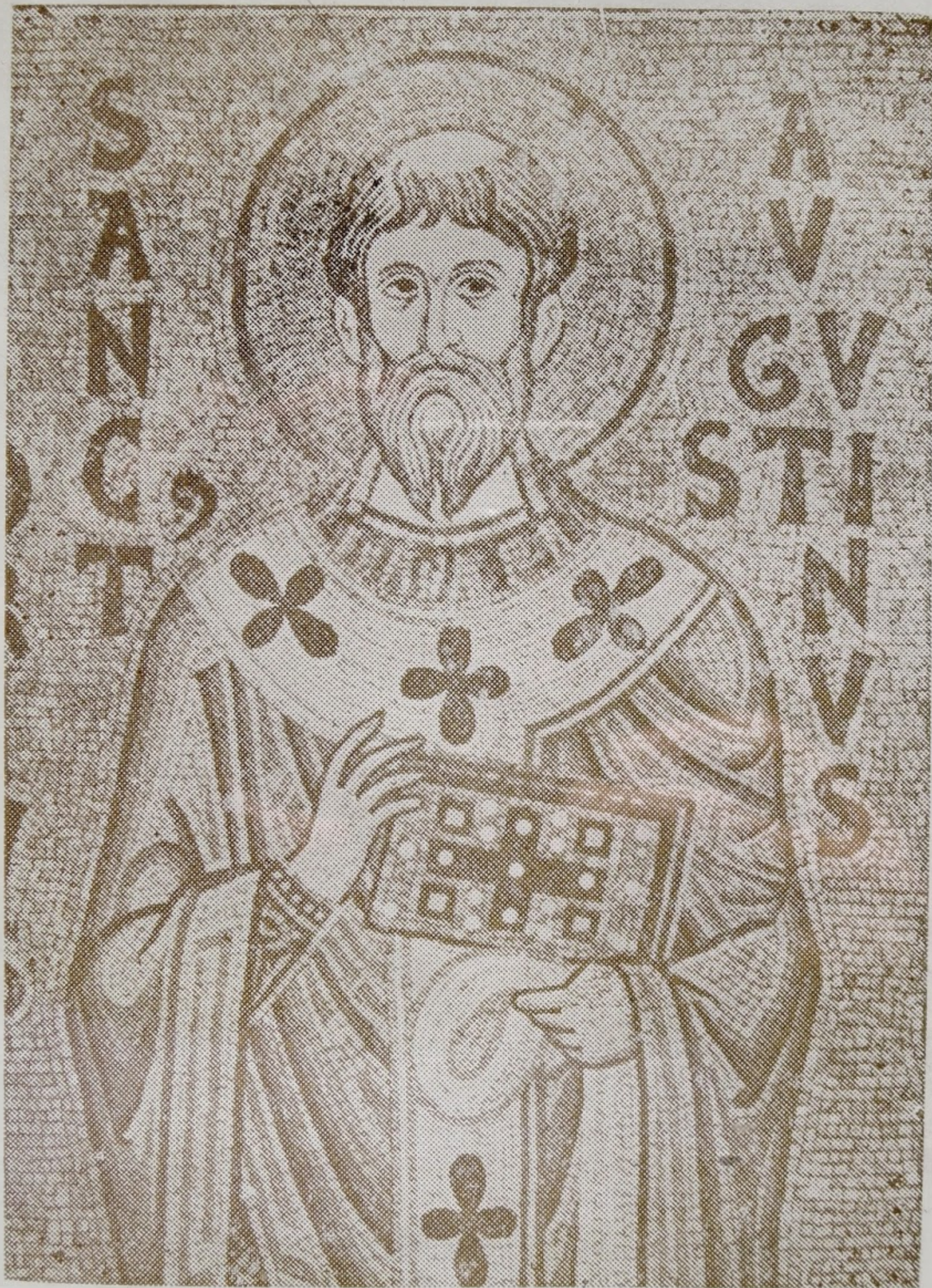
A mosaic fresco of St. Augustine, in the Cefalu Cathedral in Sicily.